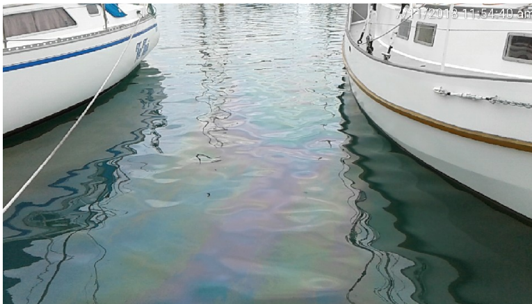
Left: Diesel from a spill in the Marina 11 th November 2018.

Of these events, one was a sinking of a vessel and the other 14 were the result of diesel or oil being discharged into the marine environment.