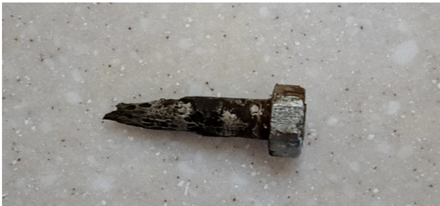
Photo: Pintle bolt after 40 years

Please be aware that the hard stand is already fully booked for December 2018 and January 2019, and is closed 21 December 2018–3 January 2019. If you want to haul-out, contact the Marina Office ASAP – you can't just turn up!