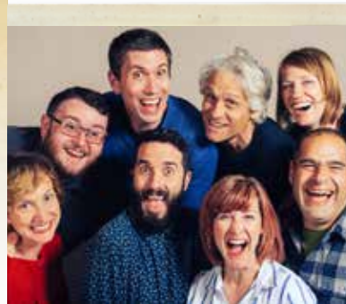
The People's Republic of Improv.

This 2-day Spoon Carving course introduces students to in-the-round carving using the well-known shape of the spoon as a model. Basic hand skills and sharpening techniques will be taught. Tool use will be extended to include the bandsaw, spokeshave and scraper. Students will finish the course with one or two unique spoons.