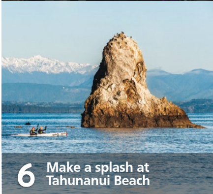
6 Make a splash at Tahunanui Beach