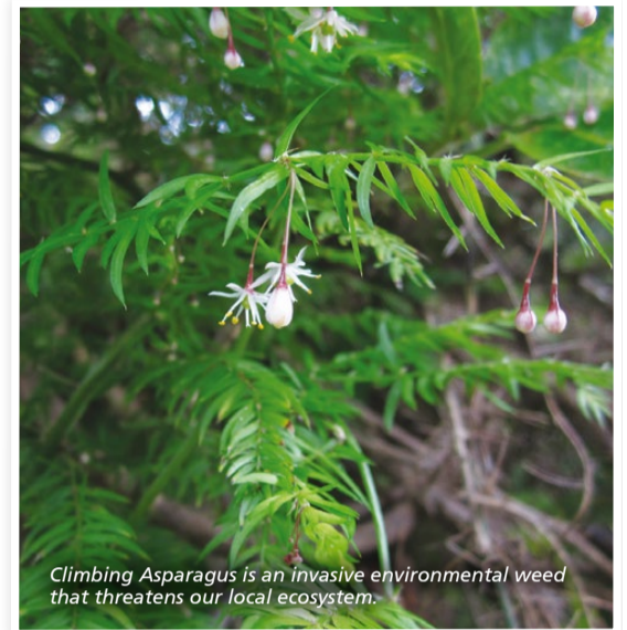
Climbing Asparagus is an invasive environmental weed that threatens our local ecosystem.

Contact the Biosecurity Officer on 03 543 8400.