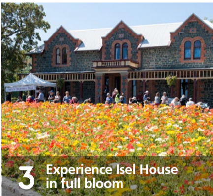
3 Experience Isel House in full bloom