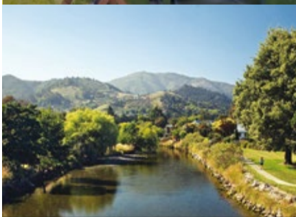
4 Working together for our environment