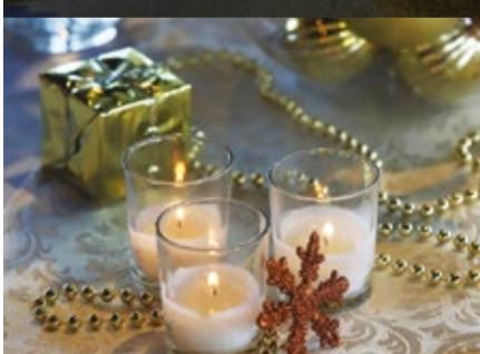
5 Tickets on sale for Nelson's Christmas Celebration