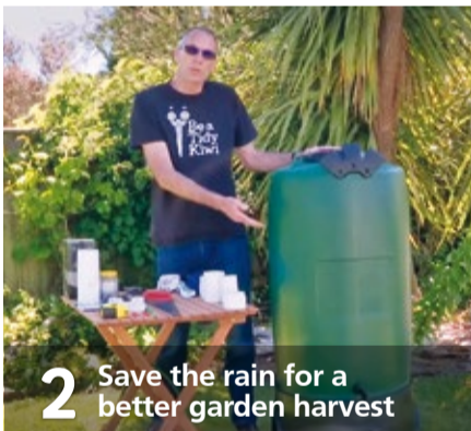
2 Save the rain for a better garden harvest

If you don't already have a programme, see summerevents.nz or itson.co.nz for more information.