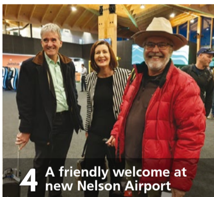
4 A friendly welcome at new Nelson Airport