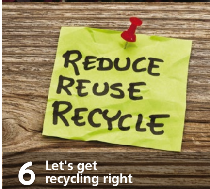
6 Let's get recycling right