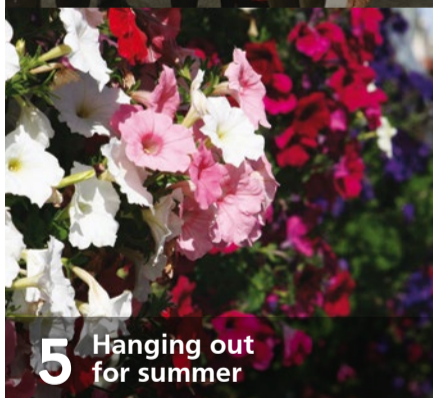
5 Hanging out for summer