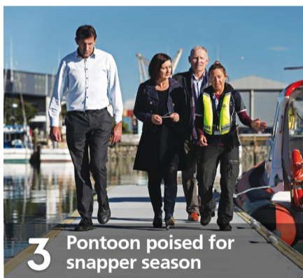
3 Pontoon poised for snapper season