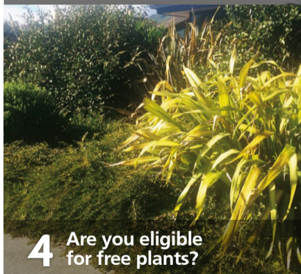
4 Are you eligible for free plants?