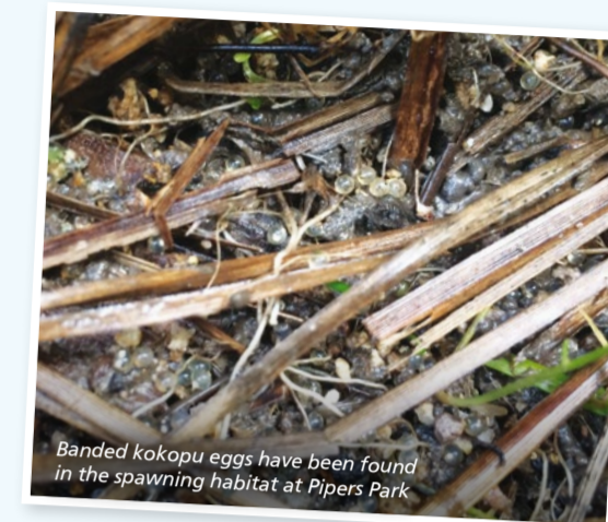
Banded kokopu eggs have been found in the spawning habitat at Pipers Park

Council's freshwater and biodiversity programmes – Healthy Streams and Nelson Nature – are seeking to further restore habitat through fish passage and water quality improvements and riparian planting.