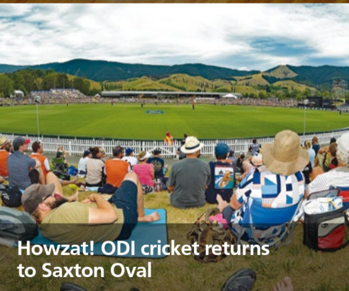
Howzat! ODI cricket returns to Saxton Oval