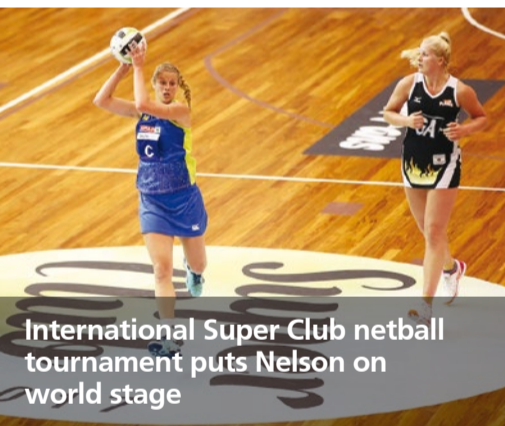
International Super Club netball tournament puts Nelson on world stage