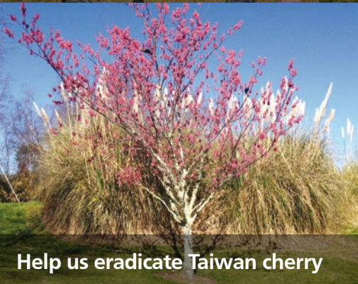
Help us eradicate Taiwan cherry