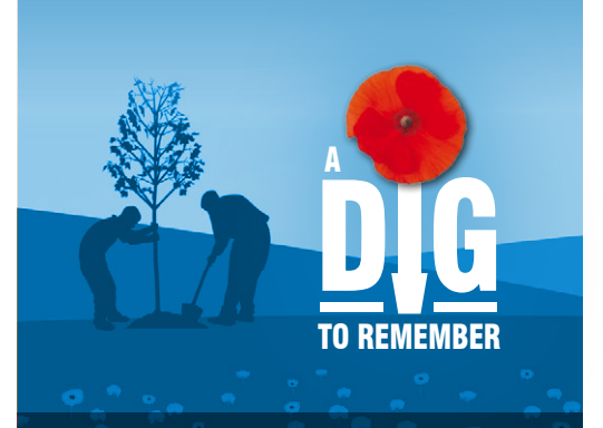
Matariki Tu Rākau commemorative planting and family picnic