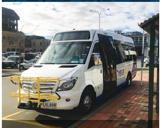
Exciting changes coming for NBus