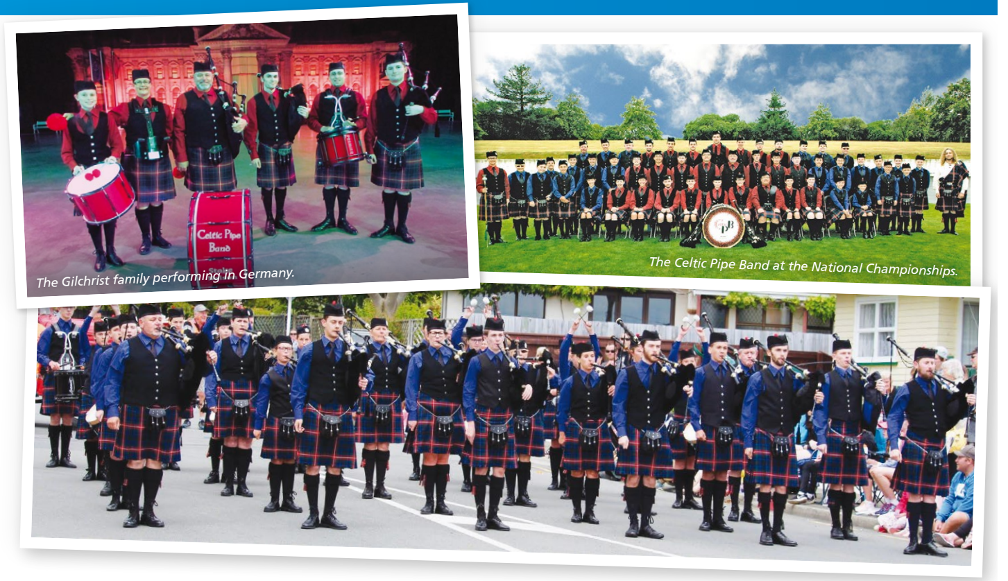
The Celtic Pipe Band at the 2017 Santa Parade