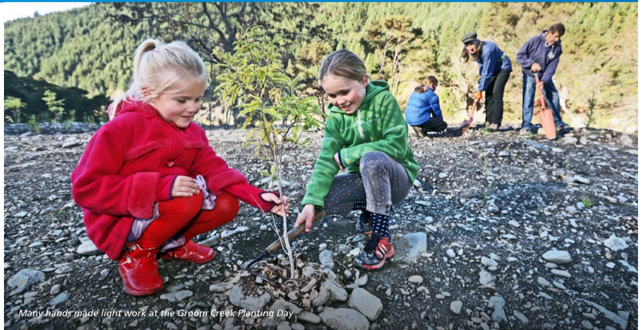
Many hands made light work at the Groom Creek Planting Day

Please note: This does not include Riverside concession cards. You can simply purchase a Richmond Aquatic Centre concession card from them to use during the closure period. Council and its contractor CLM, regrets any inconvenience this temporary closure causes, but it is needed to carry out this important work.