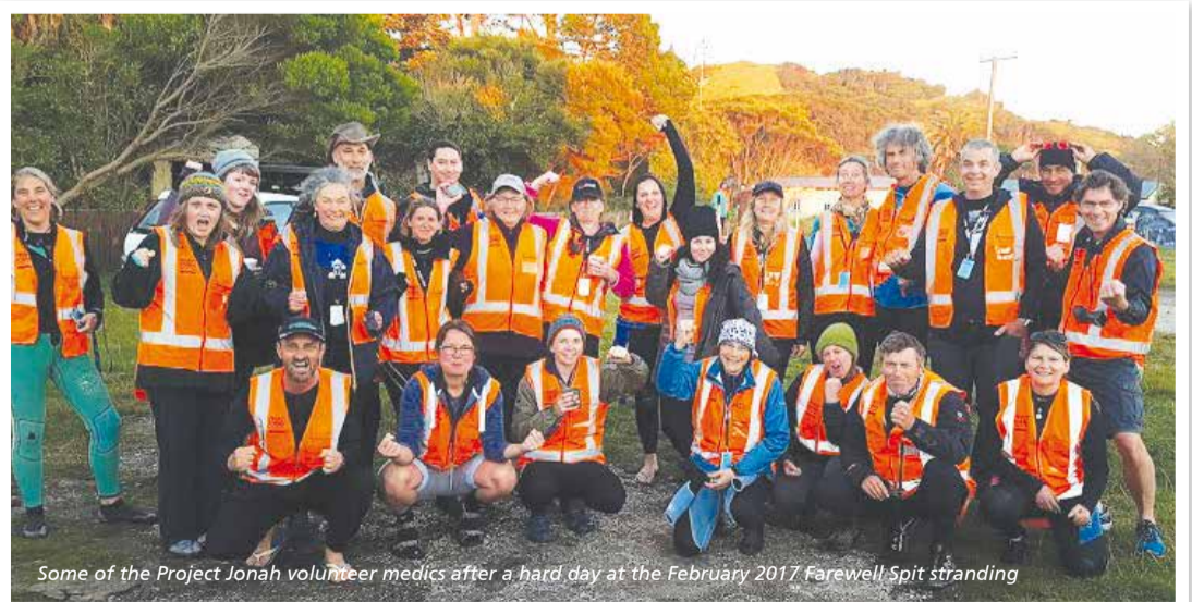
Some of the Project Jonah volunteer medics after a hard day at the February 2017 Farewell Spit stranding