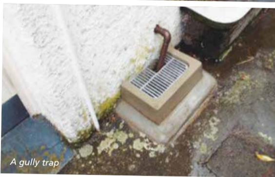
A gully trap