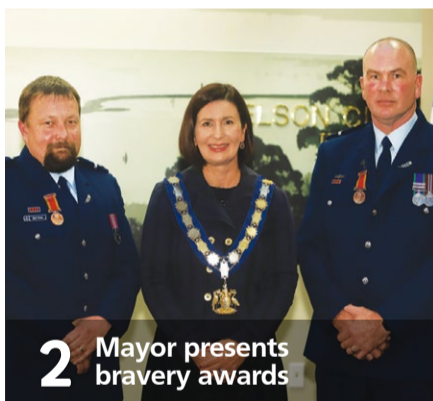
2 Mayor presents bravery awards