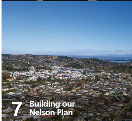
7 Building our Nelson Plan