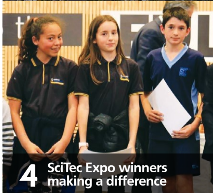
4 SciTec Expo winners making a difference