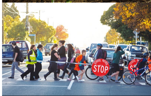
Parking near a school