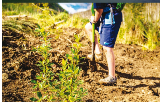
Volunteers stepping up