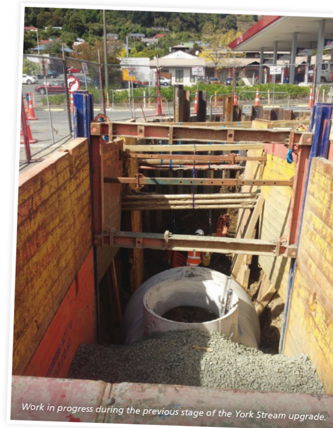
Work in progress during the previous stage of the York Stream upgrade.

This project is part of Council's ongoing commitment to improving stormwater infrastructure to reduce the risk of flood damage to roads and property in heavy rain events.