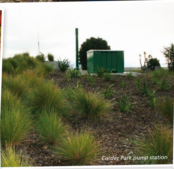
Corder Park pump station