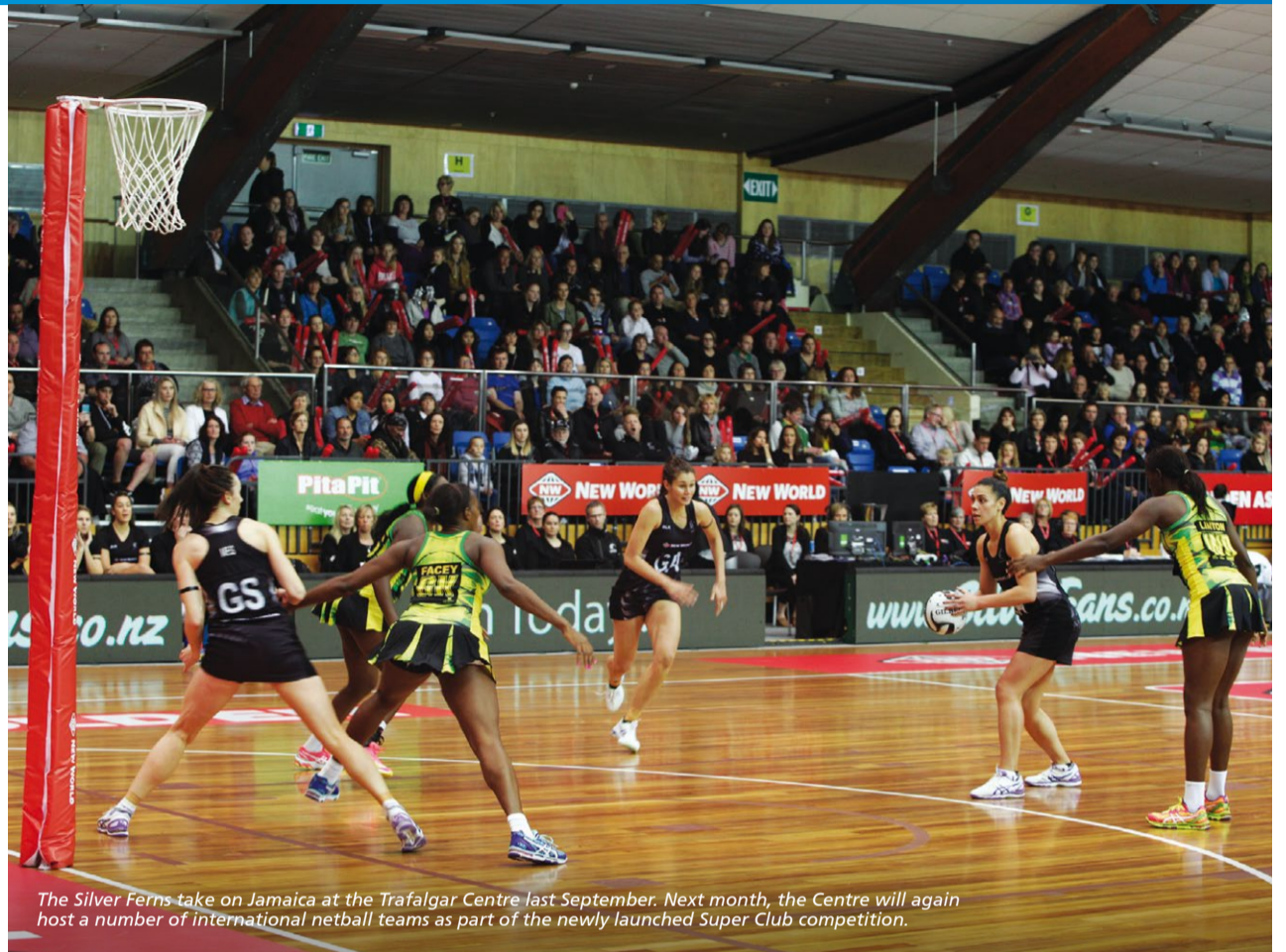
The Silver Ferns take on Jamaica at the Trafalgar Centre last September. Next month, the Centre will again host a number of international netball teams as part of the newly launched Super Club competition.