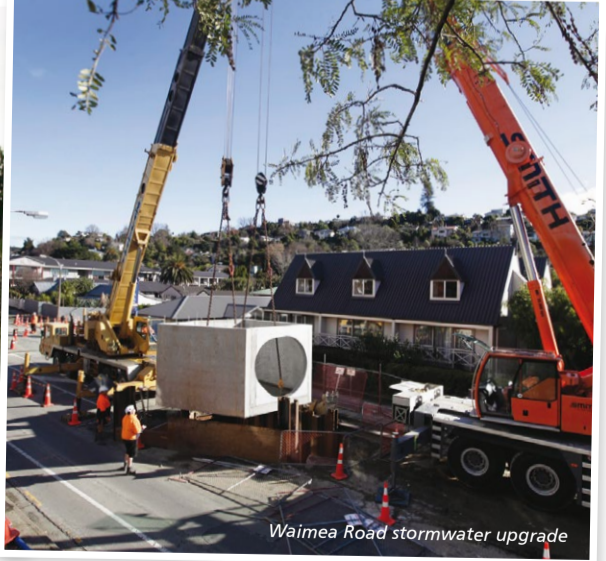
Waimea Road stormwater upgrade