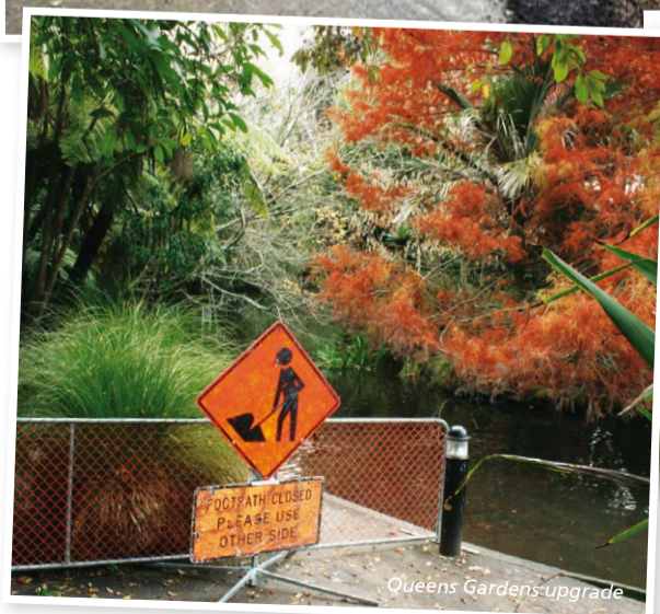
Queens Gardens upgrade