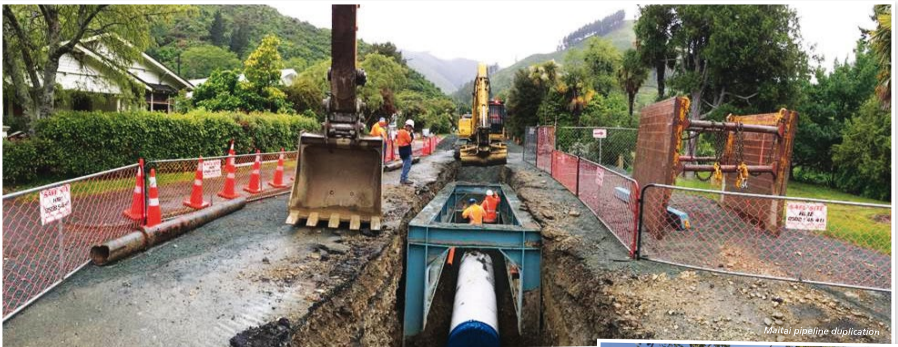
Maitai pipeline duplication

Remember you can still explore the rest of the garden, it's looking beautiful with lots of autumn colours still about.