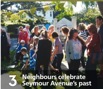
3 Neighbours celebrate Seymour Avenue's past