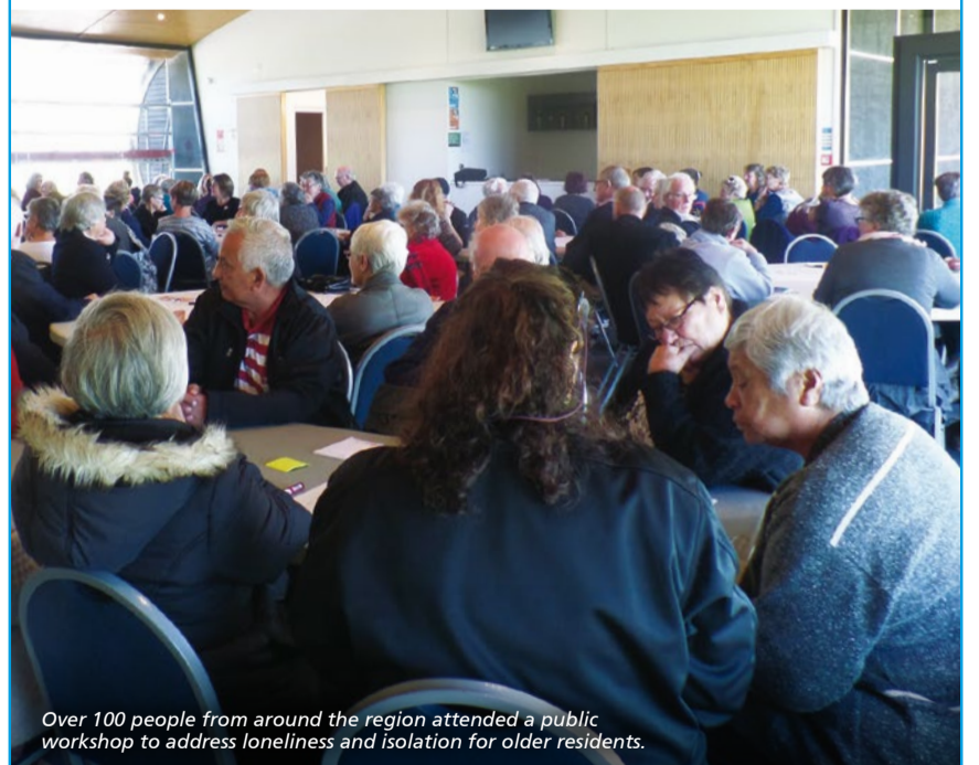
Over 100 people from around the region attended a public workshop to address loneliness and isolation for older residents.

If you want to become involved, get in touch with Age Concern on 03 544 7624 or email support@ageconcernnt.org.nz .