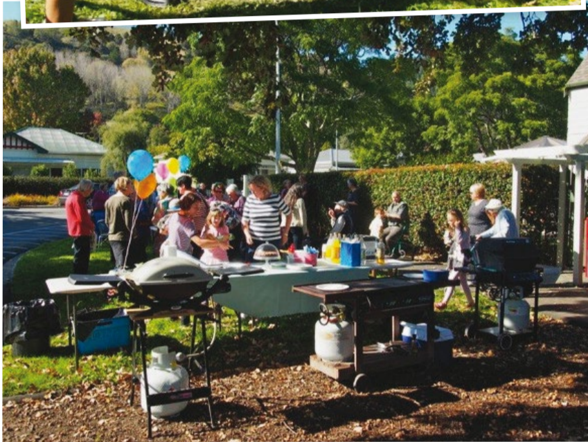
Seymour Avenue residents enjoying the unveiling of their new heritage display board.