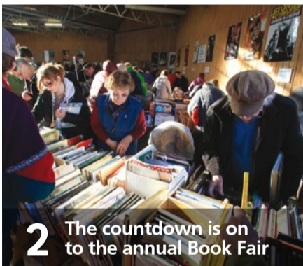
2 The countdown is on to the annual Book Fair

The Rating Information Database contains a record of all information required for the setting and assessing of rates and informing ratepayers.