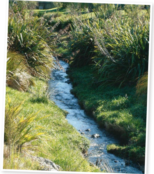
Please don't dump your garden waste into streams and ditches.