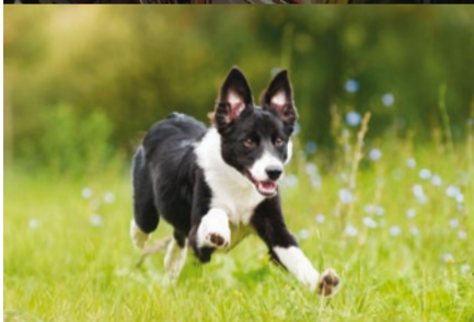
4 Register your dog online and win!