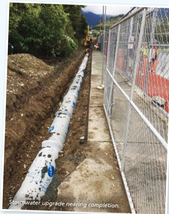
Stormwater upgrade nearing completion.

The completion of this work allows construction of the Greenmeadows Community Centre to progress unimpeded, now that the pipeline under its foundations has been diverted.