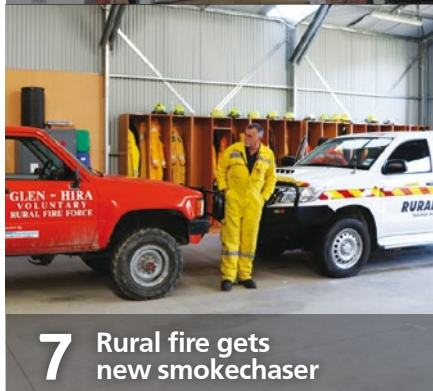
7 Rural fire gets new smokechaser

Recognising Nelsonians who are helping us make our city an even better place