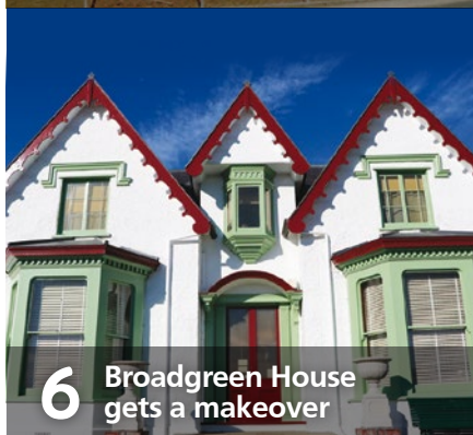
6 Broadgreen House gets a makeover