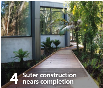
4 Suter construction nears completion

Welcome to the new look of Council's newsletter. 'Our Nelson' provides you with up-to-date information and news about what Council is doing to make Nelson an even better place. Remember, you can also sign up to our e-newsletter and receive your news online. Head to nelson.govt.nz for more information.