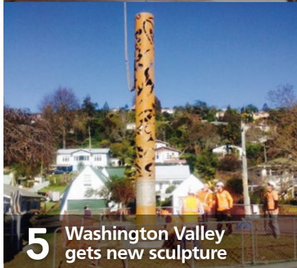
5 Washington Valley gets new sculpture