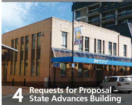
4 Requests for Proposal – State Advances Building

nelson.govt.nz facebook.com/nelsoncitycouncil