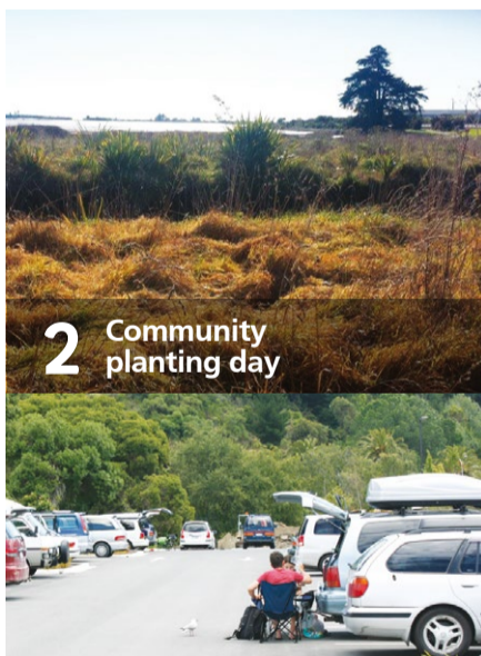
2 Community planting day

Track users can keep an eye on the Council website or Facebook page for more information.