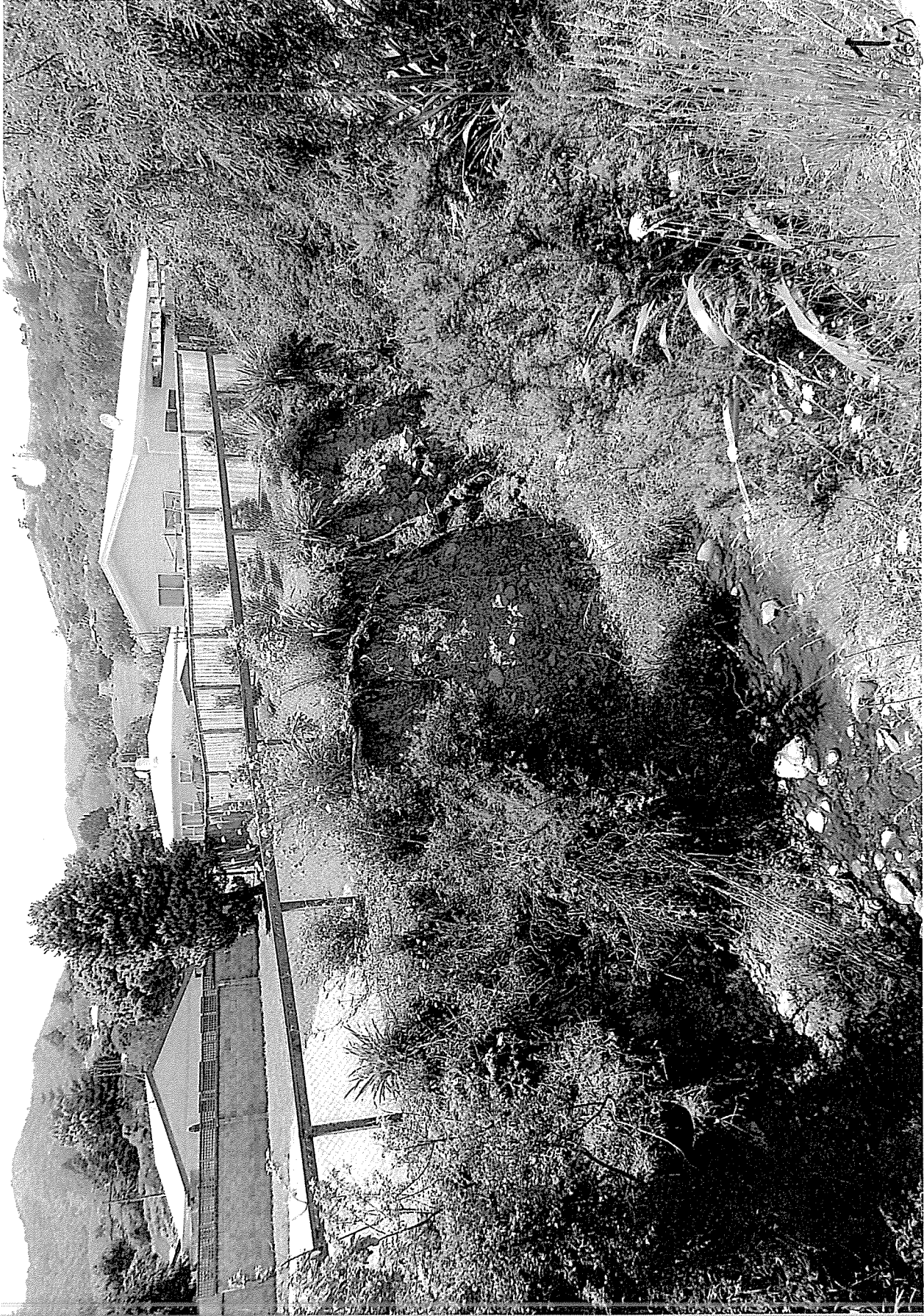
Page 22 Jenkins Creek Bank Erosion Adjacent to 97 Beatson Road Property.