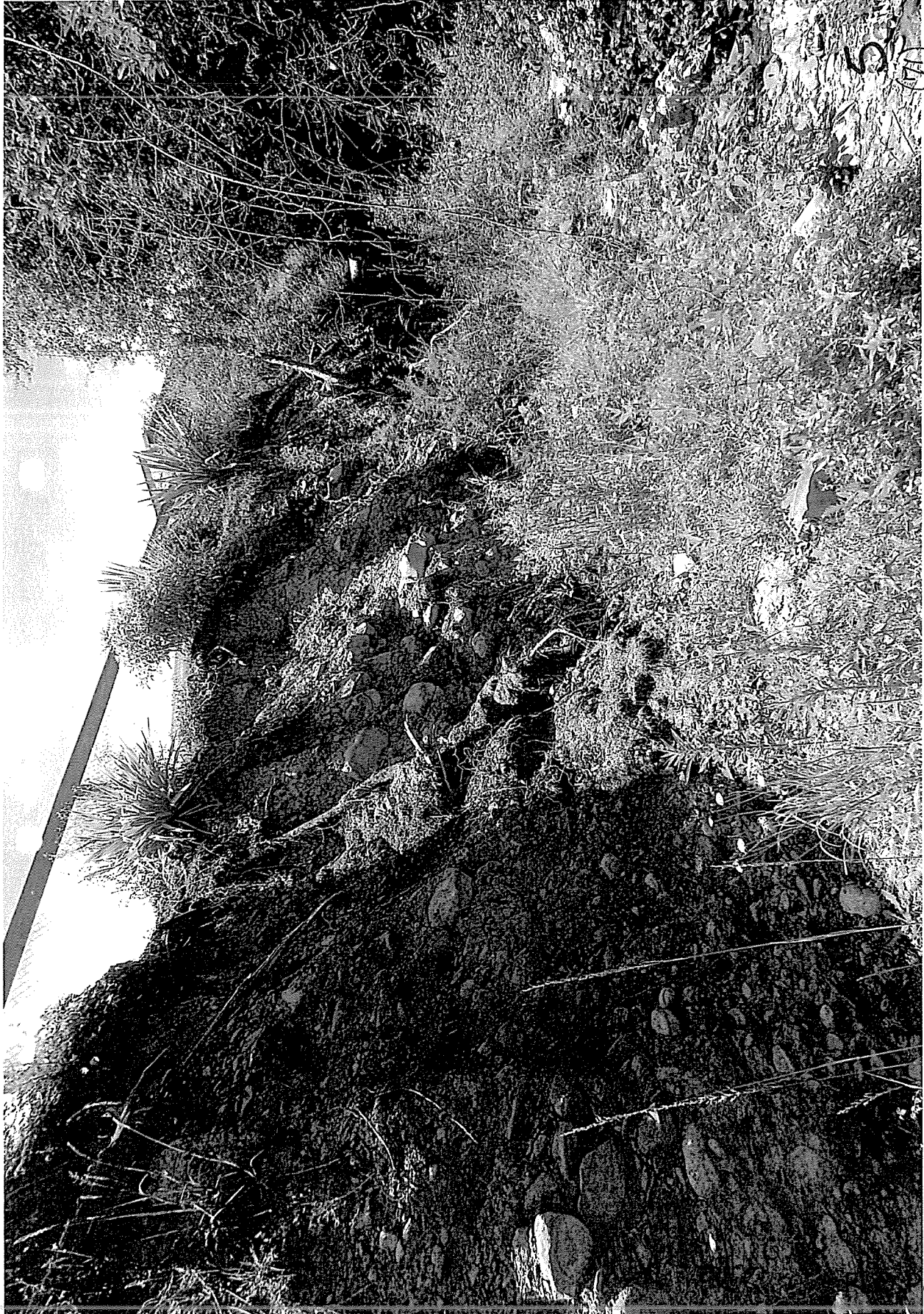
JENKINS CREEK BANK EROSION ADJACENT TO 917 BEATSON ROAD PROPERTY.