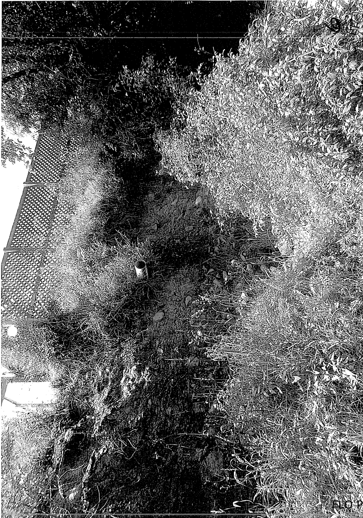
JENKINS CREEK BANK EROSION ADJACENT TO 97 BEATSON ROAD & 87 SCOTIA STREET PROPERTIES