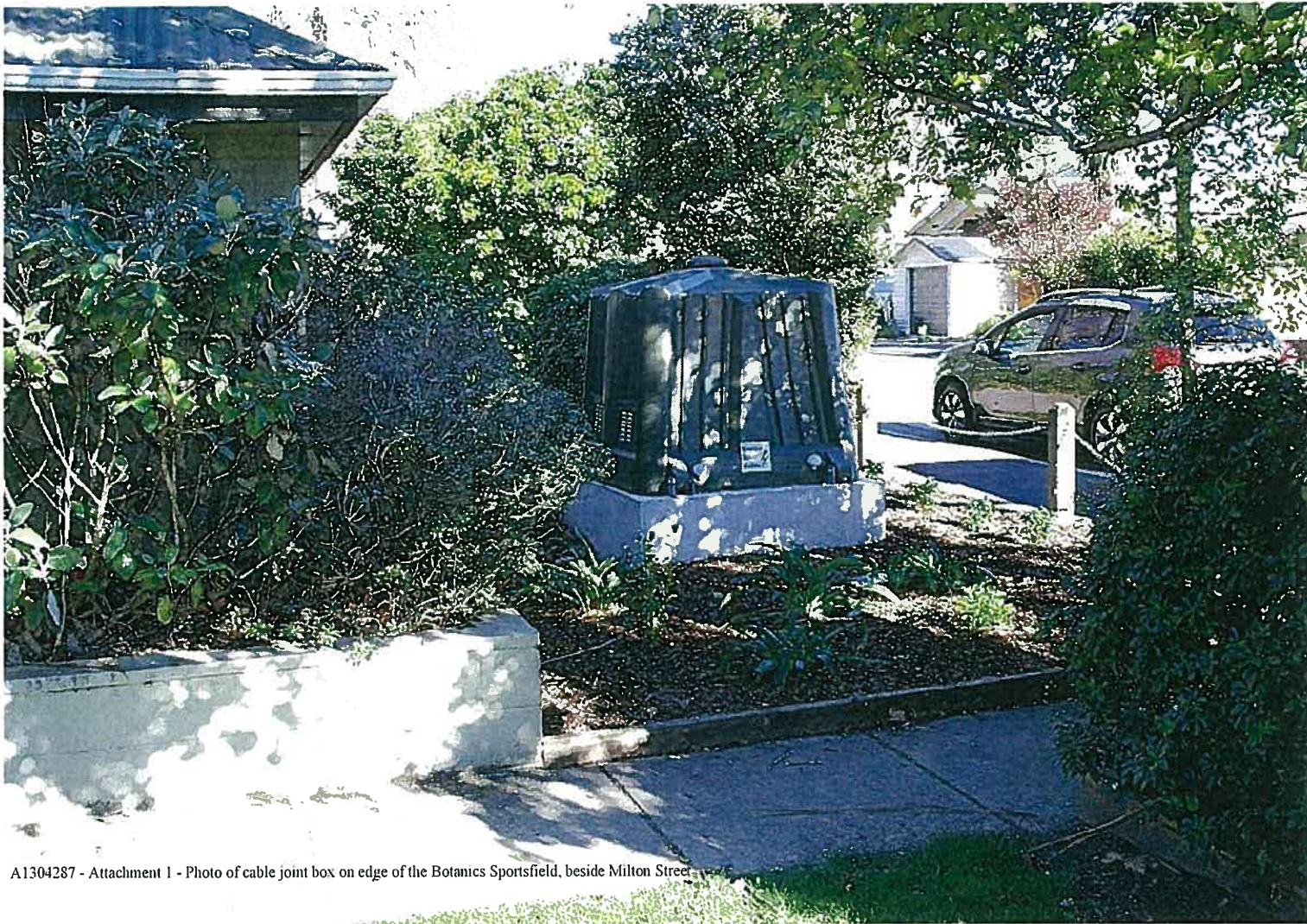
A1304287 - Attachment 1 - Photo of cable joint box on edge of the Botanics Sportsfield, beside Milton Street