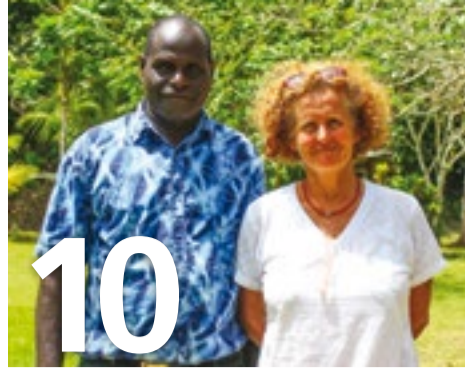
Developing the arts in Bougainville