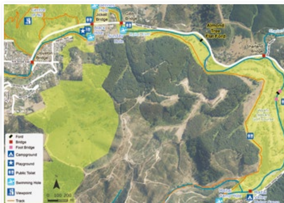
Almond Tree Flat ford is a barrier to fish migration

Following modifications to the Waahi Taakaro Golf Course ford, Almond Tree Flat ford is now the last remaining fish barrier on the Maitai River.