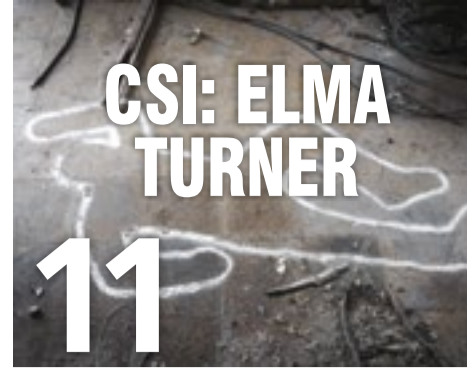
Celebrate New Zealand crime fiction at the Library