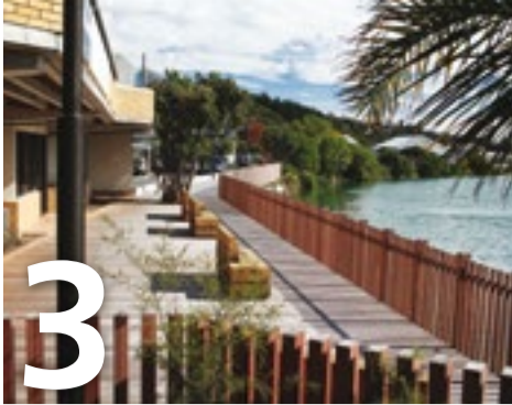
How we're making Nelson an even better place