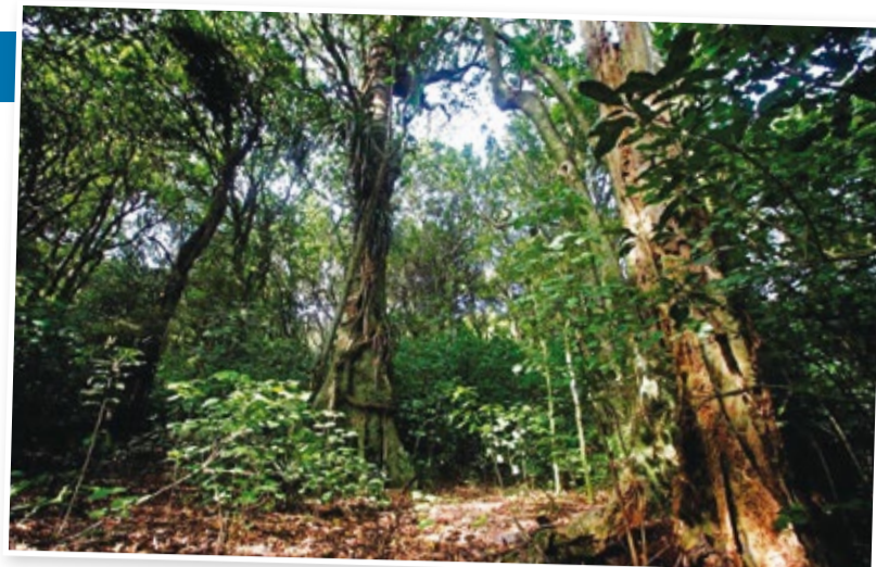
This remnant native bush in Delaware Bay is protected by a QEII covenant.

Nelsonians will have a chance to provide further feedback on the Nelson Plan review when the discussion document for the Regional Policy Statement (RPS) is released in May, which will include the Council's possible approach to protect biodiversity values.