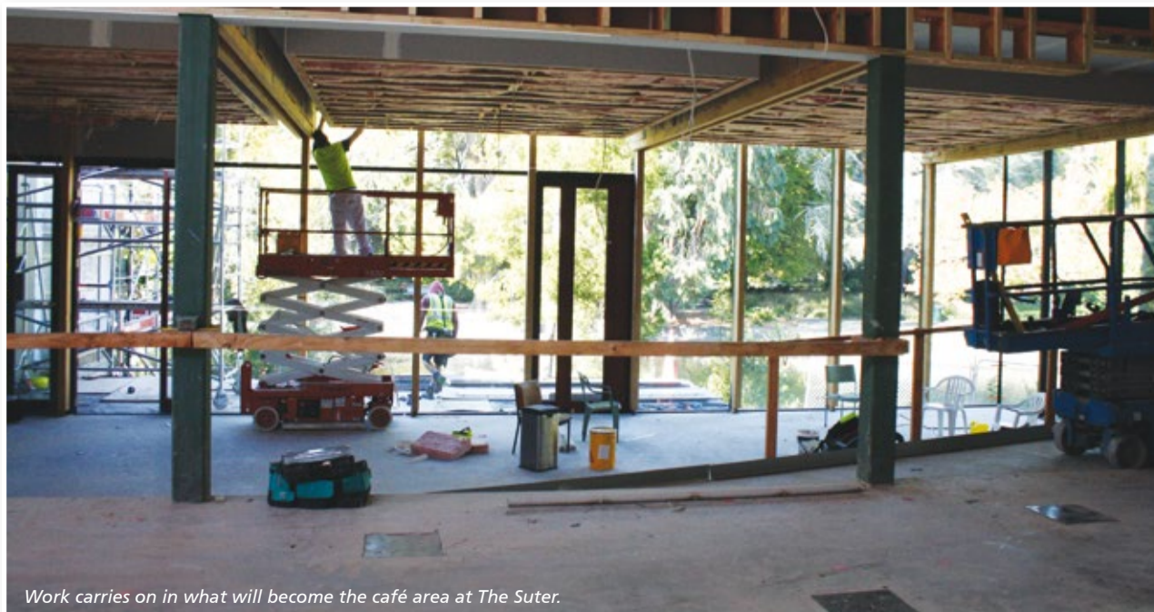
Work carries on in what will become the café area at The Suter.

The Glenduan Reserve and playground has become a well-used and much loved facility for the local community so pitch in with the planting and then stay and play a while.