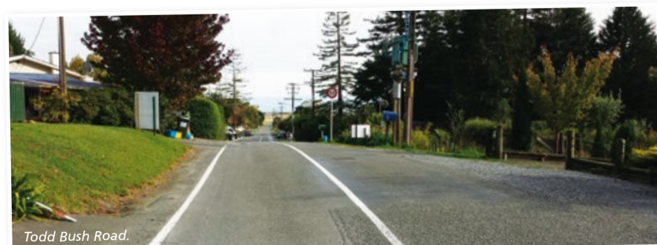
Todd Bush Road.

Please respect all the signs in place, slow down and take care around all these work sites.