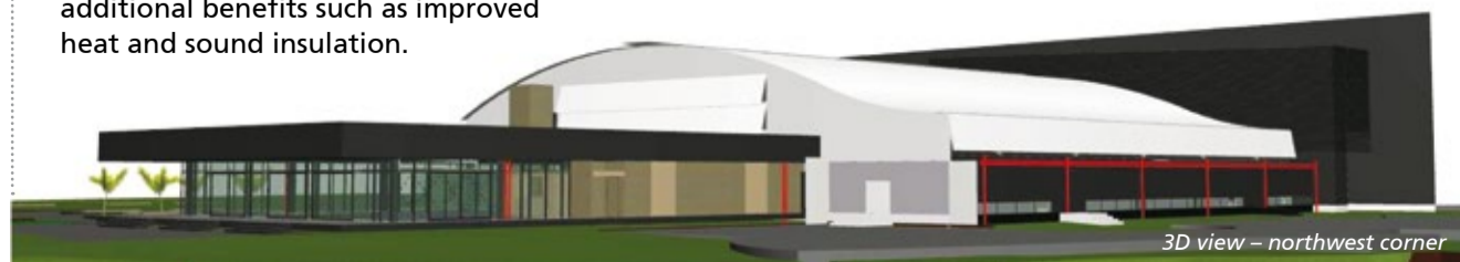
3D view – northwest corner

There was also discussion about the installation of a lift for access to the mezzanine seating on the eastern side of the stadium and television broadcast quality lights. Business cases will be developed for these projects shortly to see if the investment is justified.