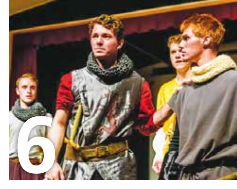
Celebrating our youth