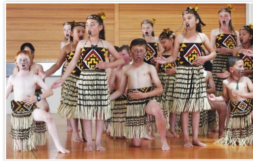
Nelson Central School 'Nga Tamariki Toa o Te Pouahi' Kapa Haka group received funding from the Creative Communities Scheme to purchase materials for their uniforms last year.