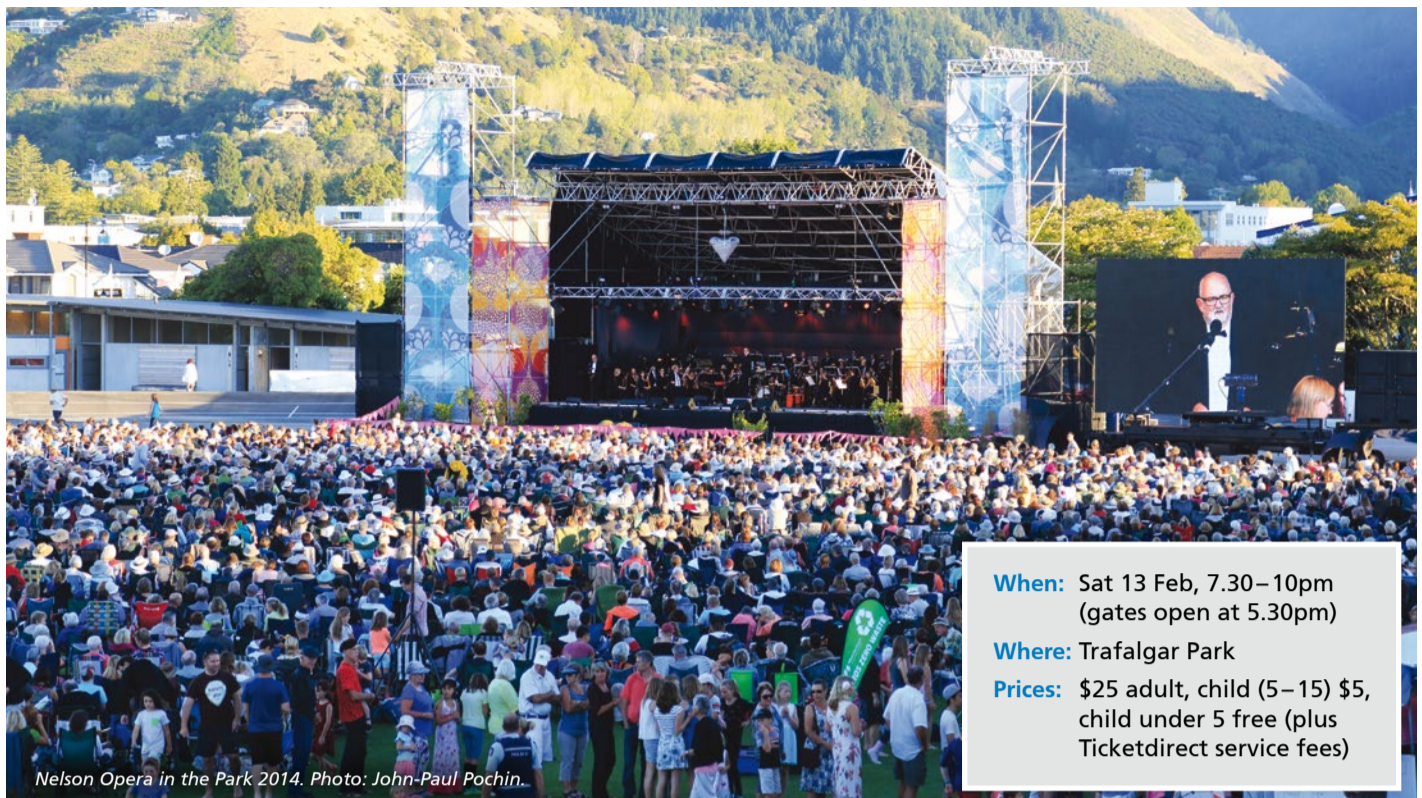
Nelson Opera in the Park 2014.

Submissions close soon on Woodburner Plan Change Get in quick to have your say on Nelson City Council's proposed Woodburner Plan Change (Plan Change A3) before submissions close on Wednesday 17 February at 5pm. The plan change proposes to allow additional Ultra Low Emission Burners (ULEBs) in some areas of the city on the basis that there will be improvements to woodburner use, generating less smoke. More information on the plan change is available on Council's website, nelson.govt.nz (search phrase = woodburner plan change). The proposed plan change document, the accompanying reports and submission form are available at the Customer Service Centre, Nelson libraries and on the council website.