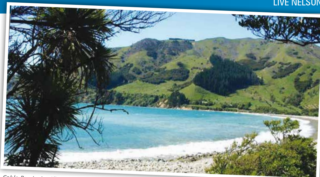
Cable Bay is classified as having a low risk of causing infection or illness on the LAWA website.

Nelsonians are being encouraged to do their surfing online before hitting the beach this summer. Beach goers can check the quality of the water at their nearest beach thanks to environmental monitoring website Land, Air, Water Aotearoa (LAWA), lawa.org.nz .