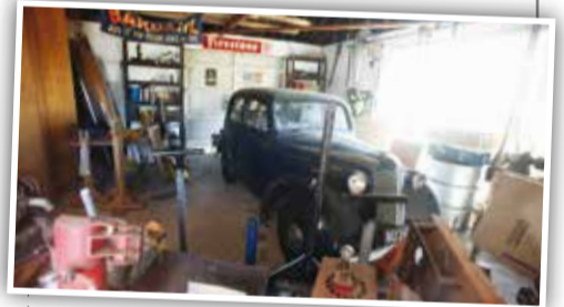
Founders has an exciting opportunity for a new tenant in its versatile Motor Garage building.

The lease is worth $5,000 per annum +GST. If you are interested in this lease, please send a simple one page proposal to maria.anderson@ncc.govt.nz before the end of the January.