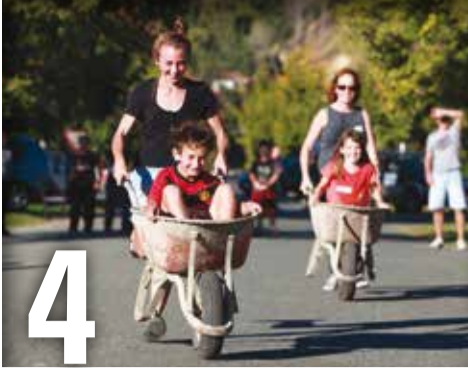
4 Vouchers on offer for neighbourhood events