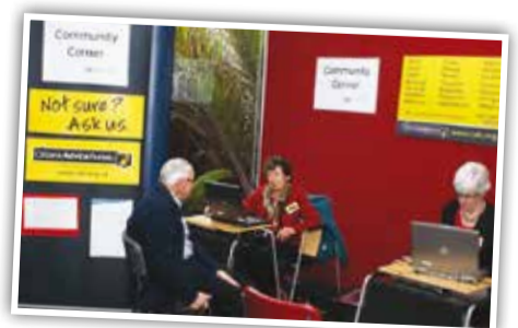
CAB volunteers publicise the service at the Elma Turner Library Community Corner.