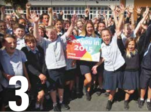
3 Countdown to a summer of cricket