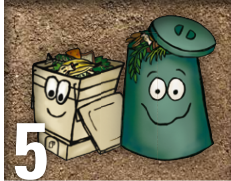
5 Coupon to help you compost