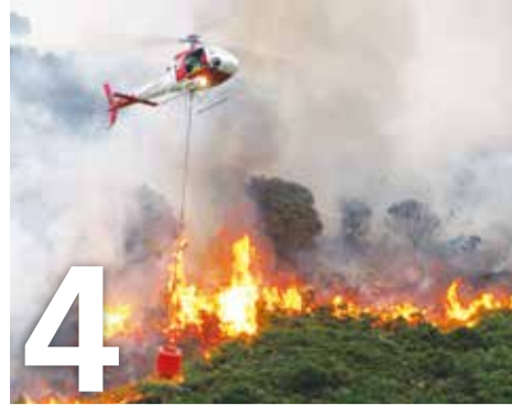
Keep Nelson safe from fires this summer