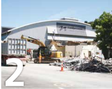
Trafalgar Centre update