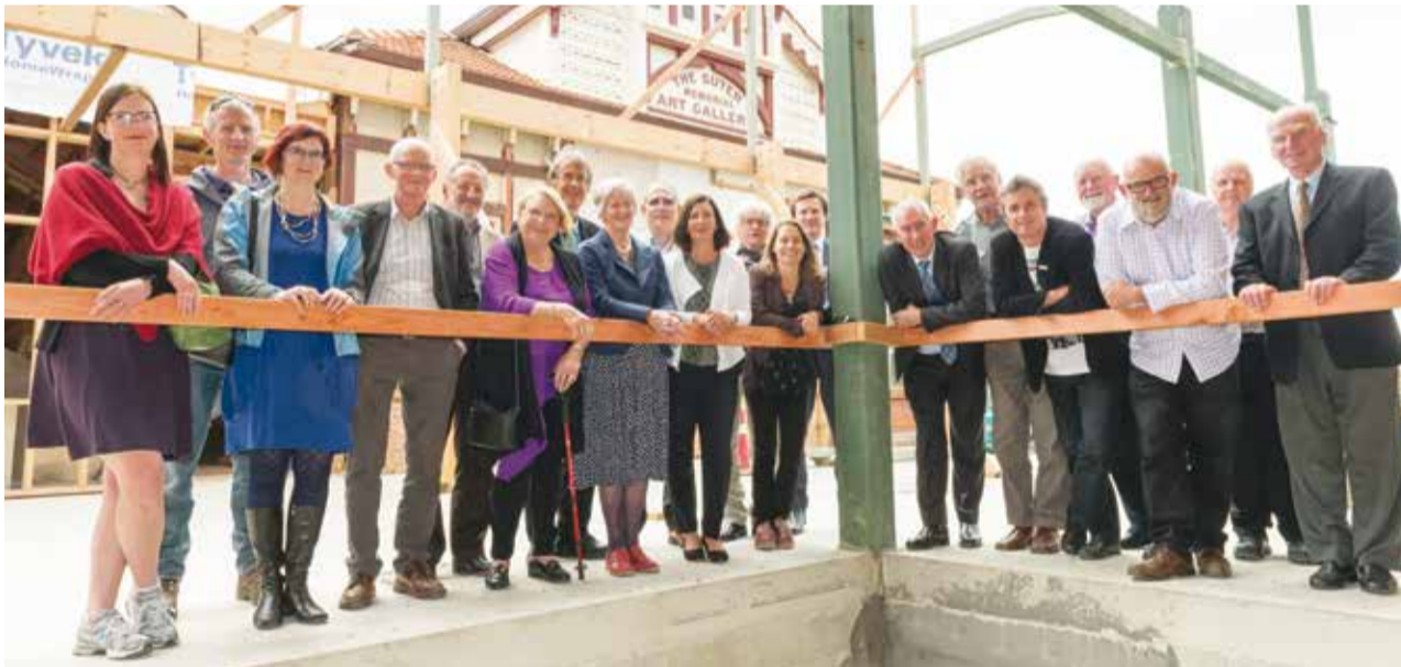
Nelson Mayor and Councillors inspect the Suter redevelopment with Bishop Suter Memorial Art Gallery Trust and Suter 2000 Appeal Trust board members.

If you know someone you consider worthy of a Mayor's Bouquet, just follow these easy steps: