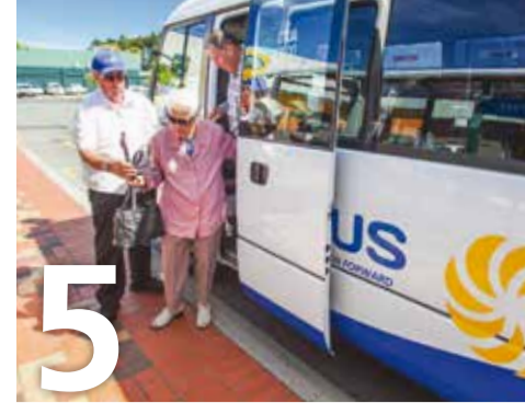
New Stoke NBus route