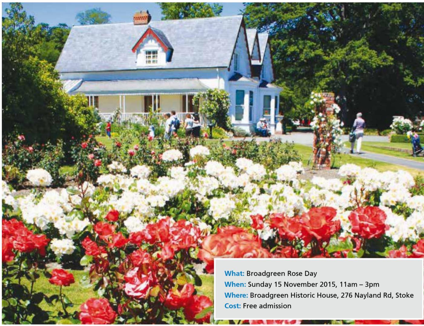
What: Broadgreen Rose Day When: Sunday 15 November 2015, 11am – 3pm Where: Broadgreen Historic House, 276 Nayland Rd, Stoke Cost: Free admission