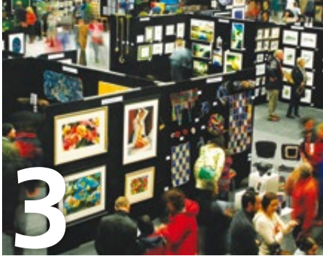
3 Arts Expo to draw record crowds