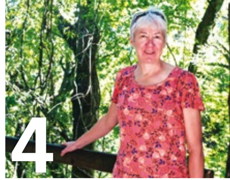
4 Help us help Nelson's nature