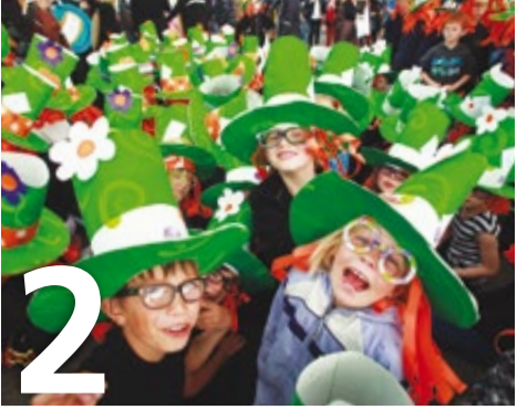
2 Get ready for the street party of the year