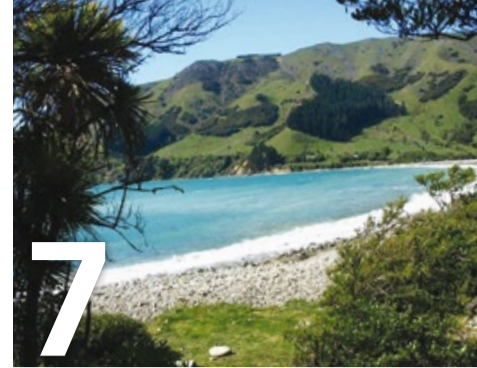
7 Nelson's environment scores are in