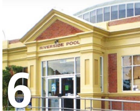
6 Nelson pool changes