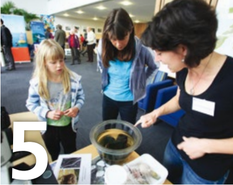
5 Cawthron Annual Open Day this Sunday