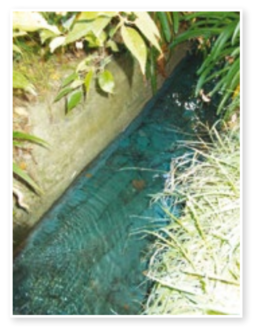
Nelson City Council is keen to remind swimming pool owners to avoid emptying their swimming pools down stormwater drains, following an incident where a swimming pool was emptied into Little Go Stream.

Even if your pool is correctly connected to the wastewater system, please notify Council that you will be emptying your pool because the chemicals found in swimming pool water can upset the balance to Nelson's sewer treatment facility. If you have any questions about how to empty your pool, please contact the Pool Compliance Officer, phone 546 0438.