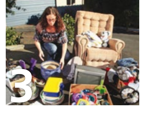
Second Hand Sunday is back this weekend