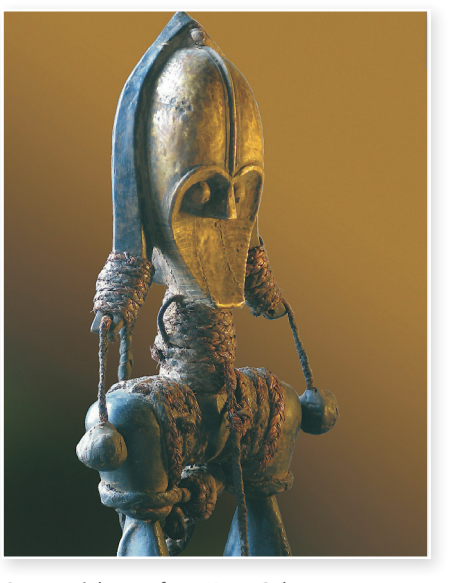
Ceremonial gong from Kota, Gabon

Visitors are welcome to enjoy the exhibition which runs from Friday February 27 - Sunday 12 April 2015.