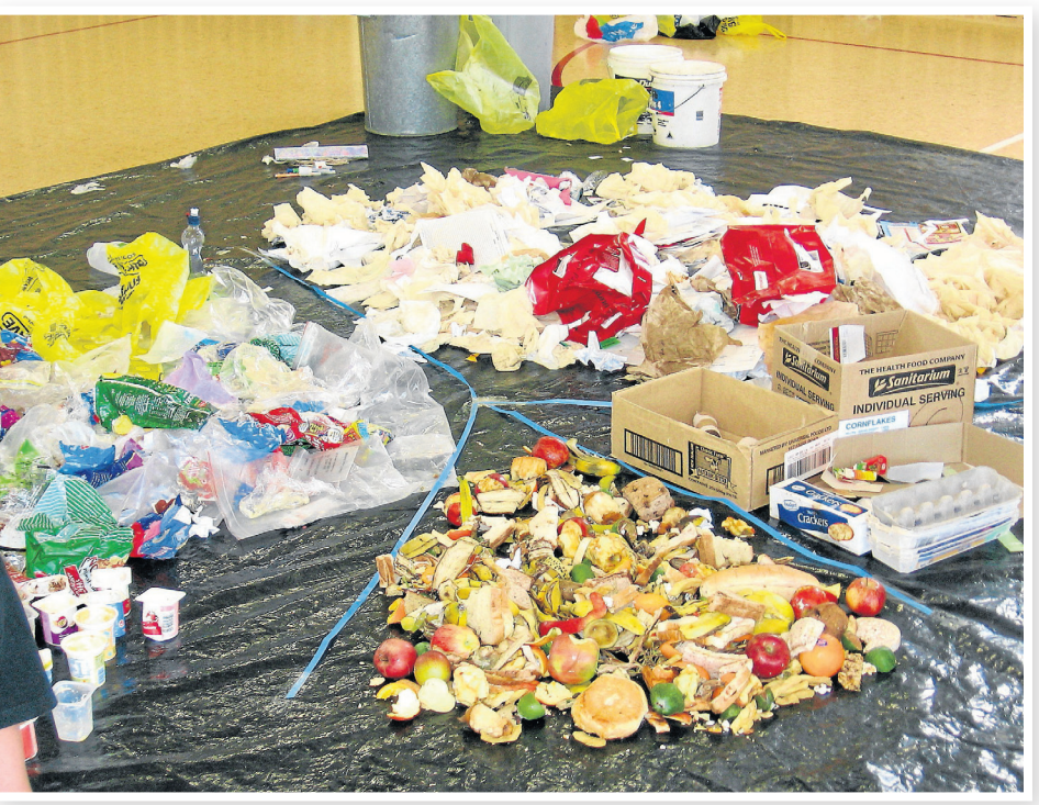
A rubbish audit at a local school illustrates the high proportion of unnecessary food waste

What is "a hopper of ditches, a cutter of corn, a little