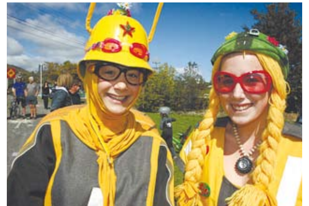
'Slo' and 'Flo' promoting road safety at the Atawhai Shared Pathway opening.