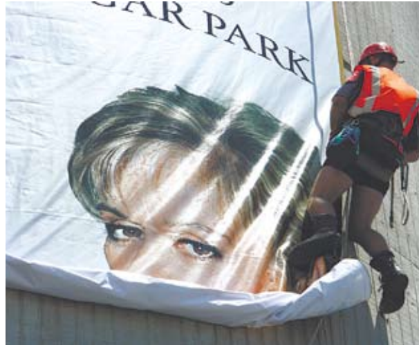
Dame Kiri Te Kanawa performed at Sealord Opera in the Park.