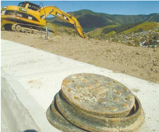
Developers contributions fund new footpaths and stormwater drains.