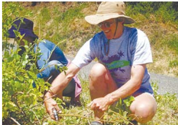
Volunteer Weedbusters at work.