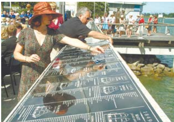
The Early Settlers Memorial Wall, Wakefield Quay.