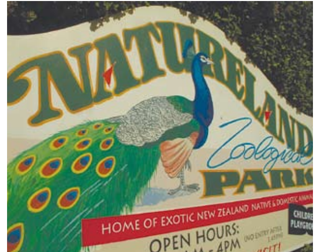
Natureland got a new owner.