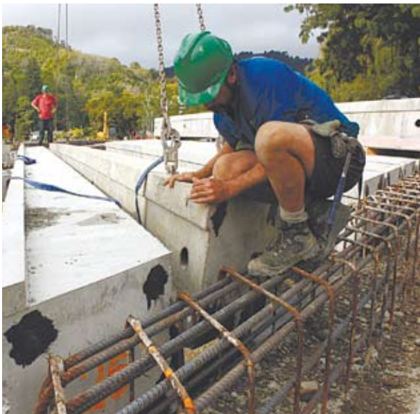
The Normanby Bridge was completed in June.

Council borrowings at $36.7 million were lower than the budgeted $58.3 million because of delays with capital projects such as the Regional Sewerage Scheme upgrade, the Campbell and Collingwood Street upgrades, and regional community facilities such as the Saxton Field Stadium and the south end of the Trafalgar Centre.