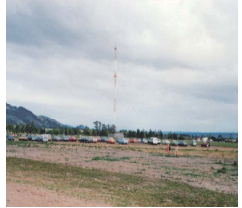
The Saxton Field aerial has long been a landmark

September – Clubrooms and amenities for enclosed ground