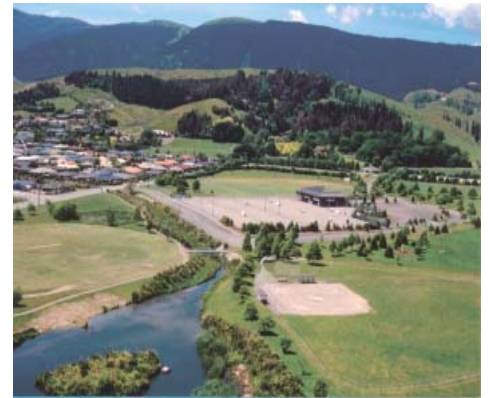
An aerial view of the netball development

Orphanage Creek, pond and village green designed. Estimated cost of work $227,000.