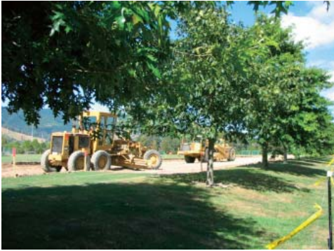
Work set to start on Stage One of the extension project