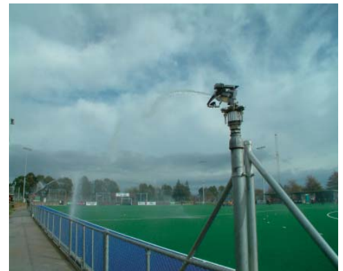
Preparing the hockey turf for play

Roading and carparks to soccer fields along the western side of Saxton Field completed.