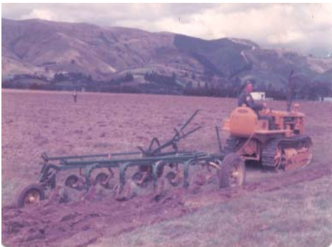
Antique farm equipment enthusiasts helped out with creating the first fields