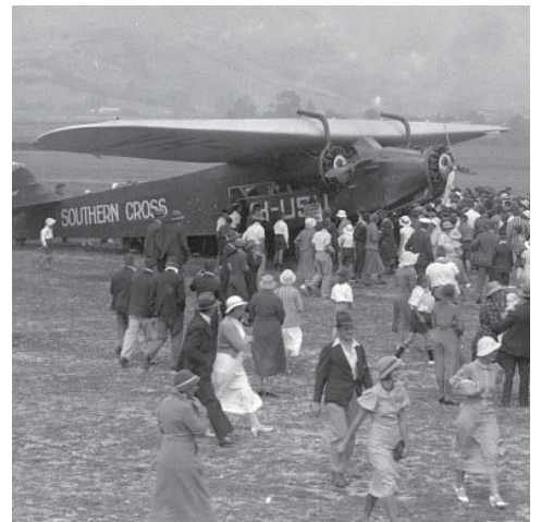
Kingsford Smith lands the 'Southern Cross', 1934 – The Nelson Provincial Museum, F N Jones Collection, 26634