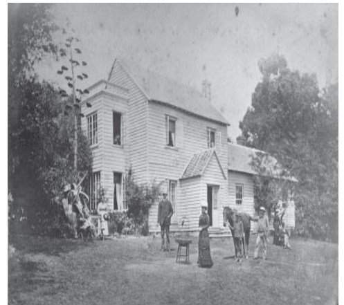
The old homestead "Oaklands"- The Nelson Provincial Museum, Nelson Historical Society Collection, C30

After negotiations with the King Turner family, the Minister of Lands and the Broadcasting Corporation of New Zealand, the Nelson City Council acquired 23.5 hectares of land, now known as Saxton Field. An additional lease of seven hectares