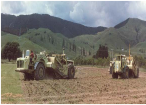
Work begins on the first grassed hockey fields

proposed by Soccer Association – expected cost approximately $575,000.