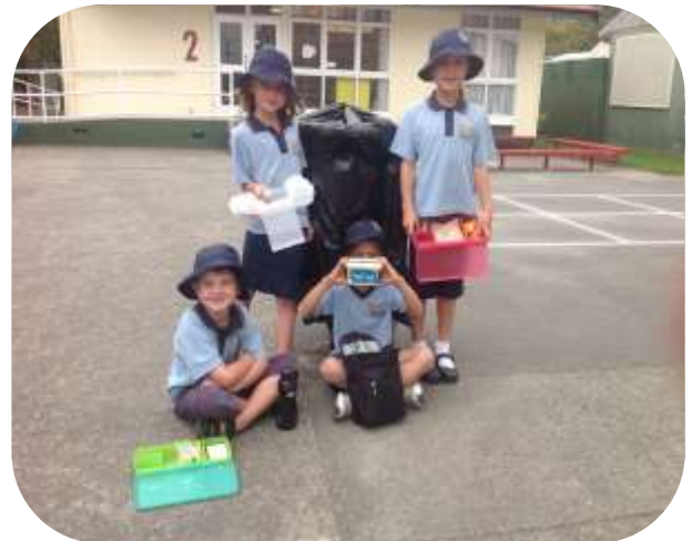
The Green Ninjas decided to make the collection of food scraps a house competition. The buckets are coloured and the house who recycles the greatest amount of food scraps earns points.