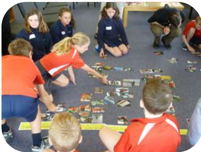
Students sorting evidence of the guiding principles across the programmes, practices, people and place at Clifton terrace.

Clifton Terrace School is Nelson's only Silver Enviroschool. To celebrate their achievement, the school was presented with a certificate and plaque at a special assembly.