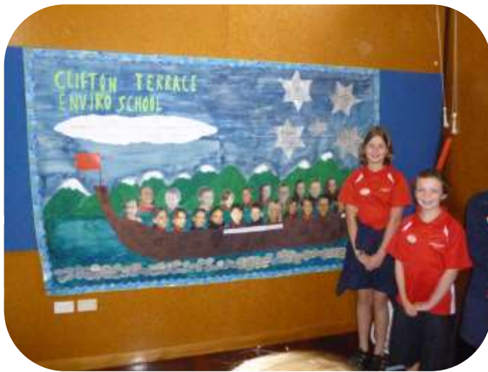
Clifton Terraces enviroschools beginning is 2010.

The reflection team were impressed by the understanding and implementation of sustainable action. Also impressive was the BOT, school management and students' steadfast determination to deepen their environmental vision for Clifton Terrace School and its community.