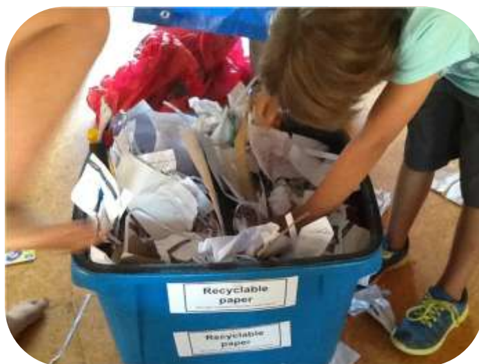
"Yes, this is all clean recyclable paper from our waste bins!"