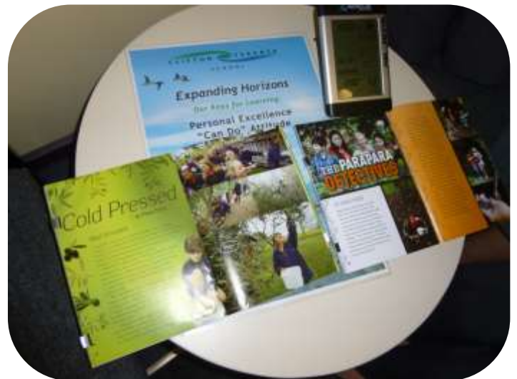
Read about the olive harvest at the school in Schools Journal: August 2013.