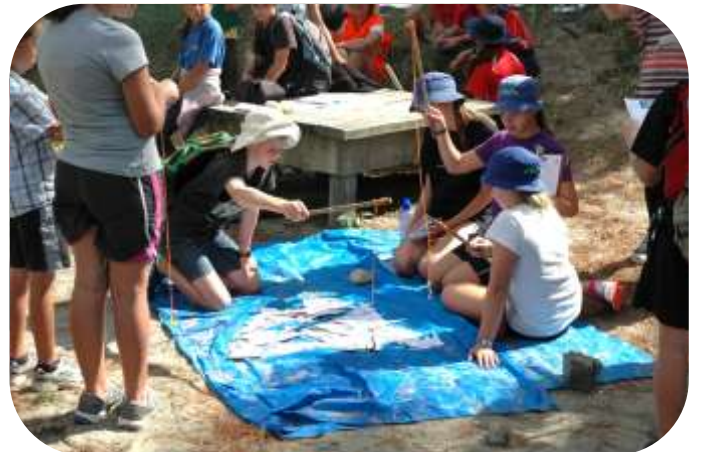
Action snapshots of the day