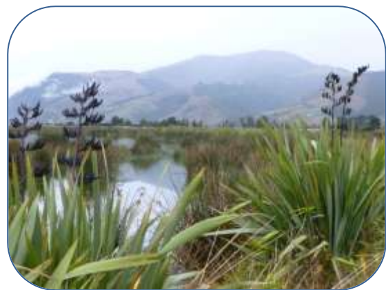
The wetlands are host to a range of wetland birds some of whom are quite shy and rare.