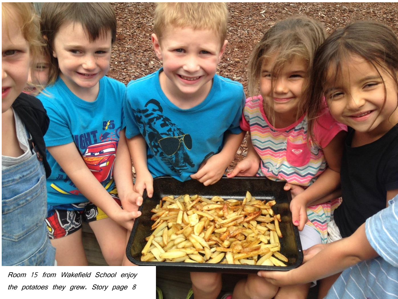
Room 15 from Wakefield School enjoy the potatoes they grew. Story page 8

IN THIS ISSUE: opportunities galore – Moturoa Mission, NZAEE conference, Enviroleaders Hui, fashion swap, submission making.