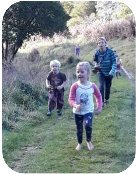
Victory School enviorgroup – pre learning before their waste audit