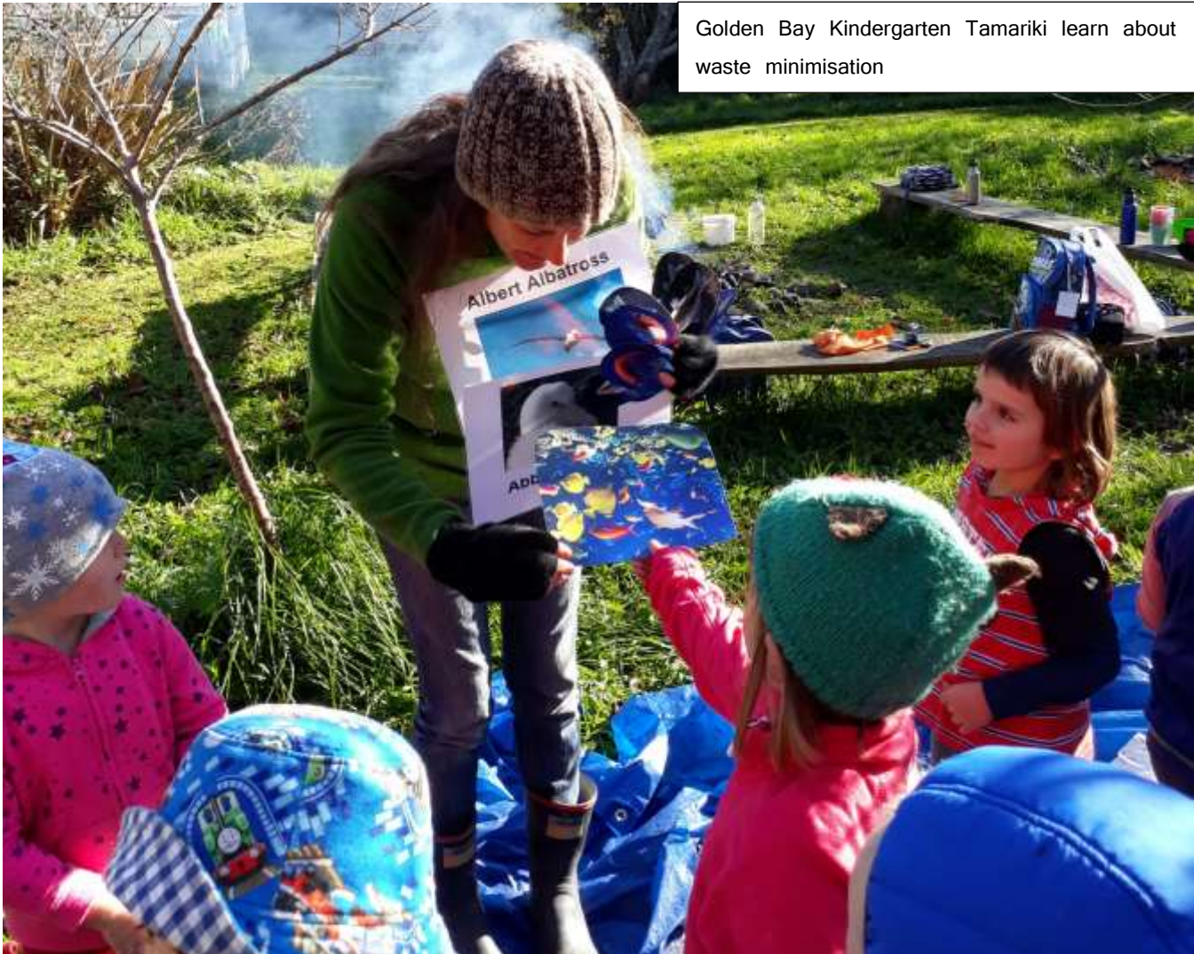
Golden Bay Kindergarten Tamariki learn about waste minimisation

IN THIS ISSUE: Youth leaders in action, Moturoa Mission photos, WaiRestoration Hui, Riuwaka and Matariki sharing's and much more