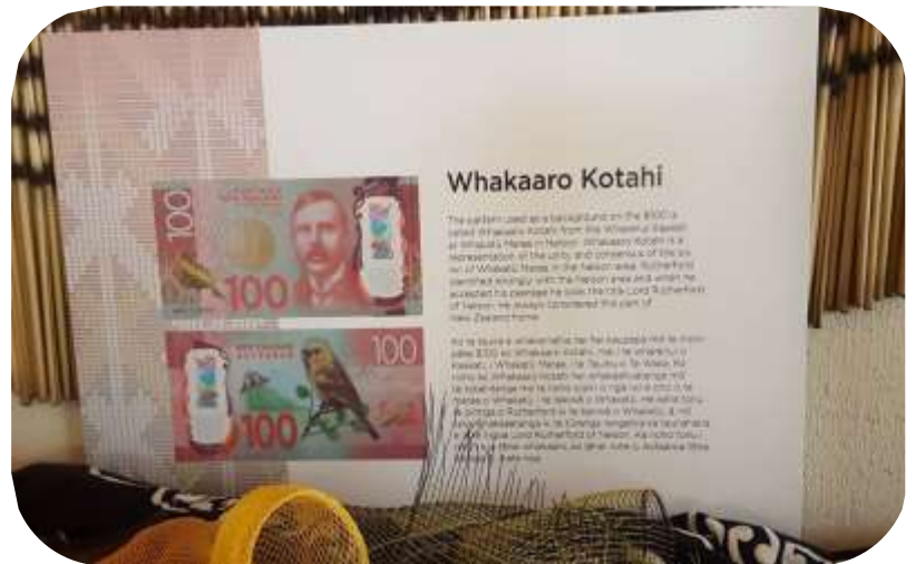
Photo taken of display at Whakatū Marae

Whakaaro Kotahi from the Whareniui Kaakati at Whakatū Marae in Nelson. Whakaaro Kotahi is a representation of the unity and consensus of the six Iwi of Whakatu Marae in the Nelson area. Rutherford identified strongly with the Nelson area and when he accepted his peerage he took the title Lord Rutherford of Nelson. He always considered this part of New Zealand home