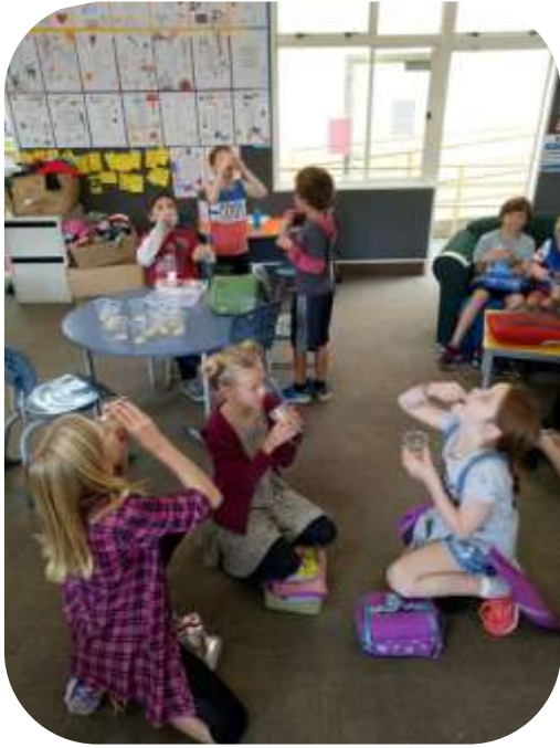
Hampden Street School – feijoa goodness