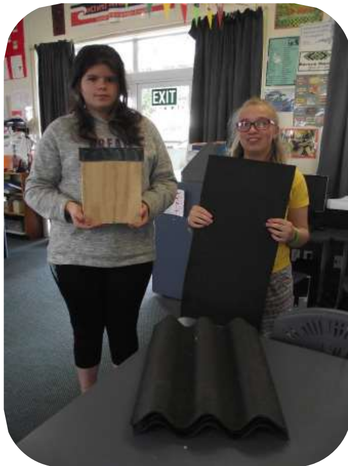
Salisbury student design and make lizard houses for Mangarakau.