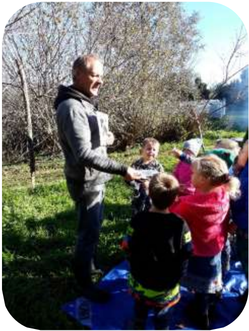
Golden Bay Kindergarten play Russell the Rubbish Bin game as they learn about waste minimisation.