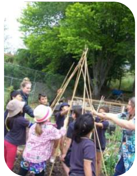
Building a tepee for the beans is fun!

This will allow one more school to participate in KEGS, effectively increasing the number of schools growing and cooking healthy food in Nelson.