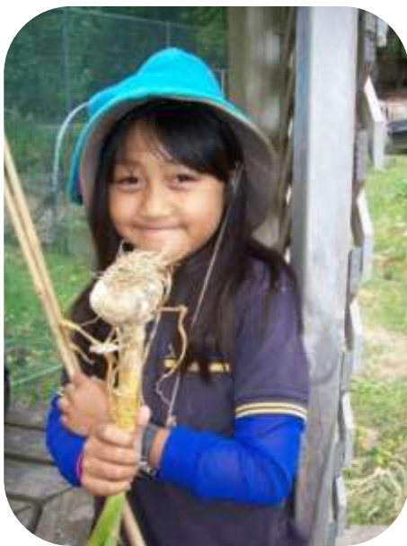
The garlic looks great!

Last term, the Kids Edible Gardens (KEGS) students planted zucchinis, peas, beans, tomatoes, sunflowers, and pumpkins and took seeds to plant at home. This is a great way for them to share their knowledge and enthusiasm with their families. They harvested the garlic that they had planted at Matariki and built a tepee from bamboo sticks. They learned how to plant beans either side of each pole, one finger-length deep. The school this year will move from KEGS to a new programme “Garden To Table” (GTT) that is setting up in our region. Garden To Table is very similar to KEGS, but with equal emphasis on cooking and growing.