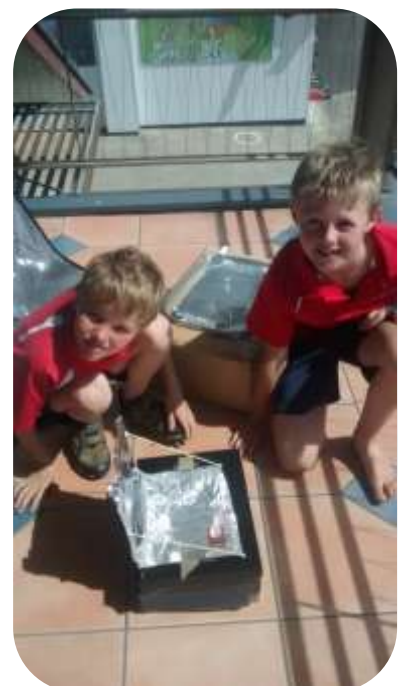
Hands-on teacher workshops.