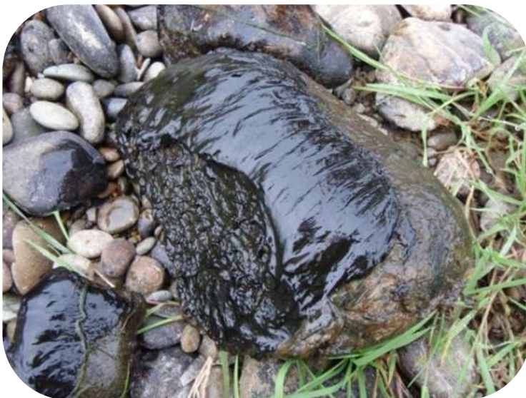
A rock removed from the stream with toxic algae on it

For more information, visit nelson.govt.nz or tasman.govt.nz and search = toxic algae.