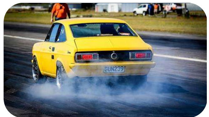
NZ's fastest street car dragster with an electrifying difference