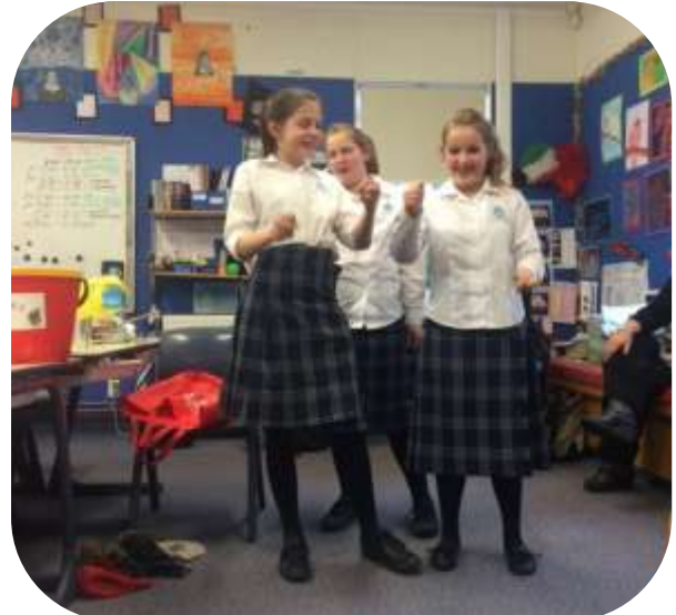
Role play in the Oil Game