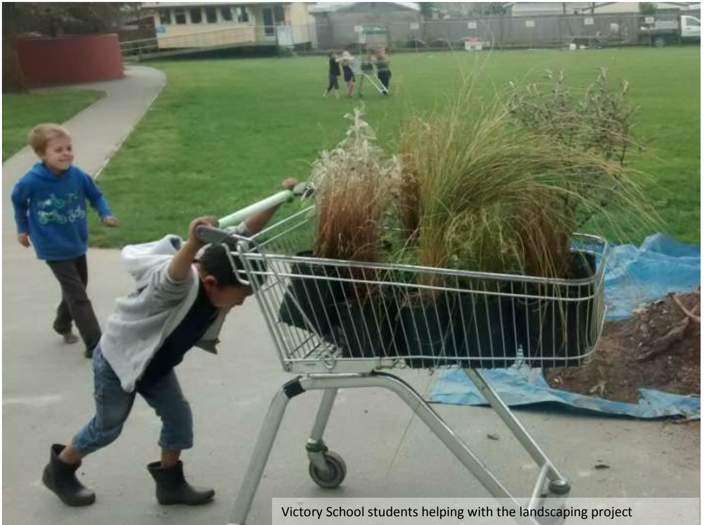
Victory School students helping with the landscaping project

IN THIS ISSUE: Conservation Week, school updates, meet Chelsea, Enviroschools Secondary workshop on offer, EVelocity challenge, a water conservation activity page and more