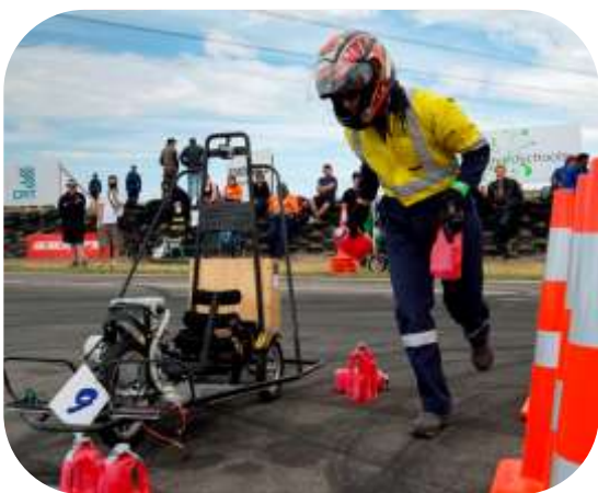
School teams competing