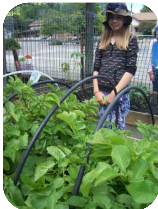
A Hampden Street School student tending the potato patch