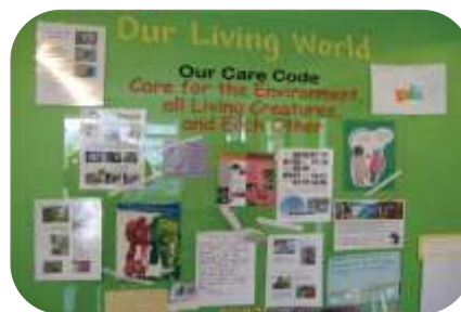
Tawa Montessori's Care Code