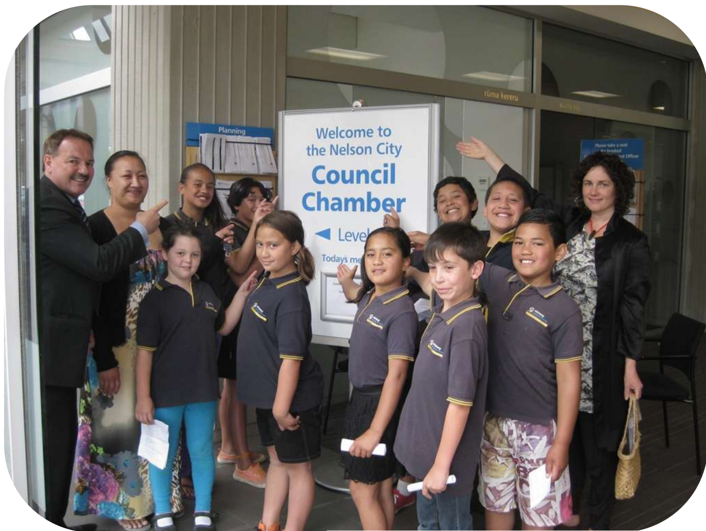
Sustainable actions at Victory School Details on page 9