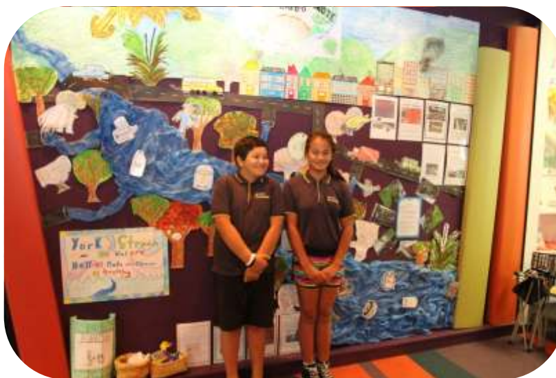
The interactive wall presentation at the Elma Turner Library, Nelson

The classes had also created an interactive wall presentation about their term's work, which is on display at Elma Turner Library, Nelson.