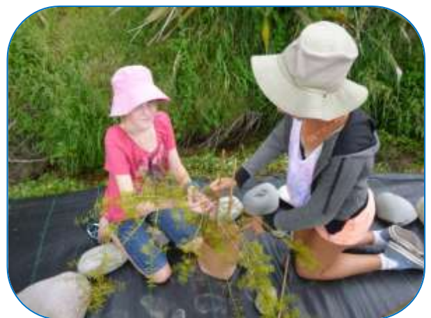
Envirogroup students planting a totara, one of the many riparian seedlings.