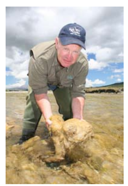
Handfuls of didymo.

So my challenge is to become more aware of and responsible for my actions. What is your personal focus this term?