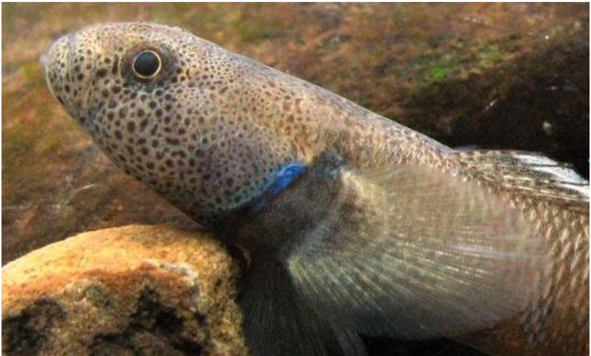
Figure 4: Bluegill bully (male) ( Stella McQueen )

Bluegill bullies feed mainly on benthic invertebrates in rapids and riffles. Male and female adult fish appear to have somewhat separate populations, males most often inhabiting lower reaches of rivers and streams and females more commonly found in upper reaches. Spawning habitat is unknown but because of possible habitat separation between the sexes, fish of at least one sex may have to migrate for spawning. Fish passage throughout bluegill bully habitat may therefore be essential for successful reproduction.