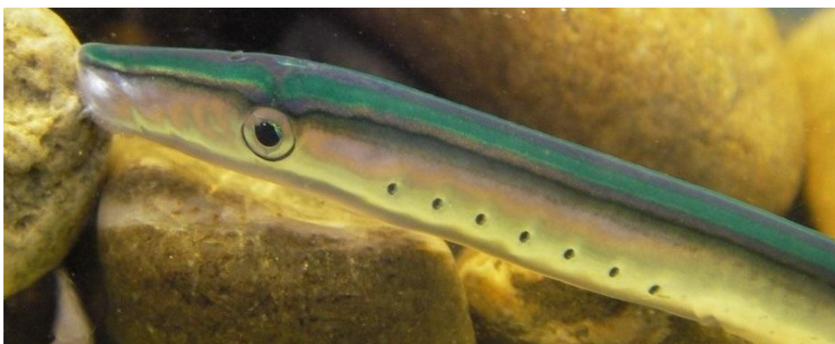
Figure 1: Lamprey ( Mike Joy, Massey University )

Lamprey (Figure 1) are migratory fish that are long-lived and very secretive. They have particular significance as a food source to Māori in many parts of the country. Lamprey can penetrate far inland and have a reasonable ability to negotiate barriers, leaving the water to move across land in a similar manner to eels.