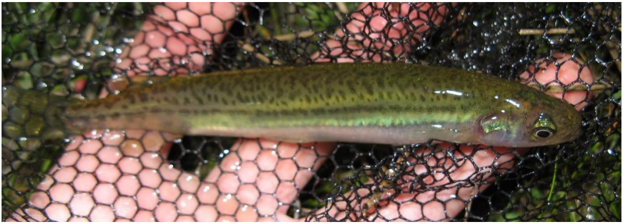
Figure 8: Īnanga ( Stella McQueen )

Mature adults migrate to estuaries in autumn to spawn in marginal estuarine vegetation during king tides. Eggs develop in humid air, hatching when inundated during the following king tide. Larvae migrate to sea for 21-23 weeks, returning in spring as part of the whitebait run. Inanga make up the greatest proportion of the whitebait catch.