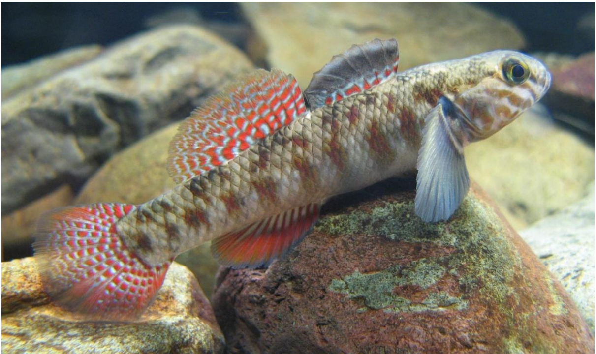
Figure 5: Redfin bully (male) ( Stella McQueen )

Spawning occurs between July and November on the underside of large rocks upstream of adult habitat; male fish defend nest sites. Hatching is stimulated by high flow events and juveniles are washed downstream to the sea returning to freshwater throughout the summer (from November).