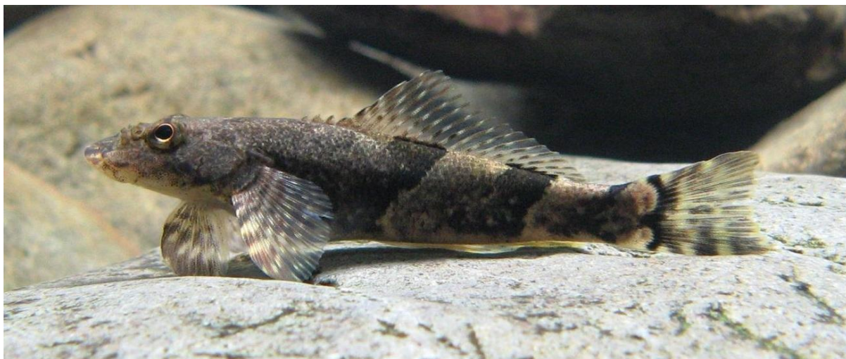
Figure 3: Torrentfish ( Stella McQueen )

Torrentfish (Figure 3) are diadromous migrants that move long distances up and down rivers throughout their lives. Due to their swift-water swimming ability they tend to inhabit the mid to upper reaches of fast-flowing rivers and streams and are able to negotiate their way upstream through large rapids. As their name suggests they are often found in rapids or ‘torrents’ and their distribution is closely associated with swift-flowing, open rivers with gravel or bouldery substrate.