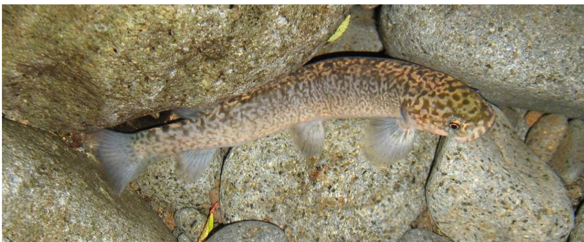
Figure 7: Kōaro ( Stella McQueen )

Koaro (Figure 7) probably have the best climbing ability of all the diadromous Galaxiid fish. They penetrate well inland and inhabit steep gully streams with heavily forested margins. Nationally, koaro are the second most common species in the whitebait catch, although this has not been verified for Nelson.