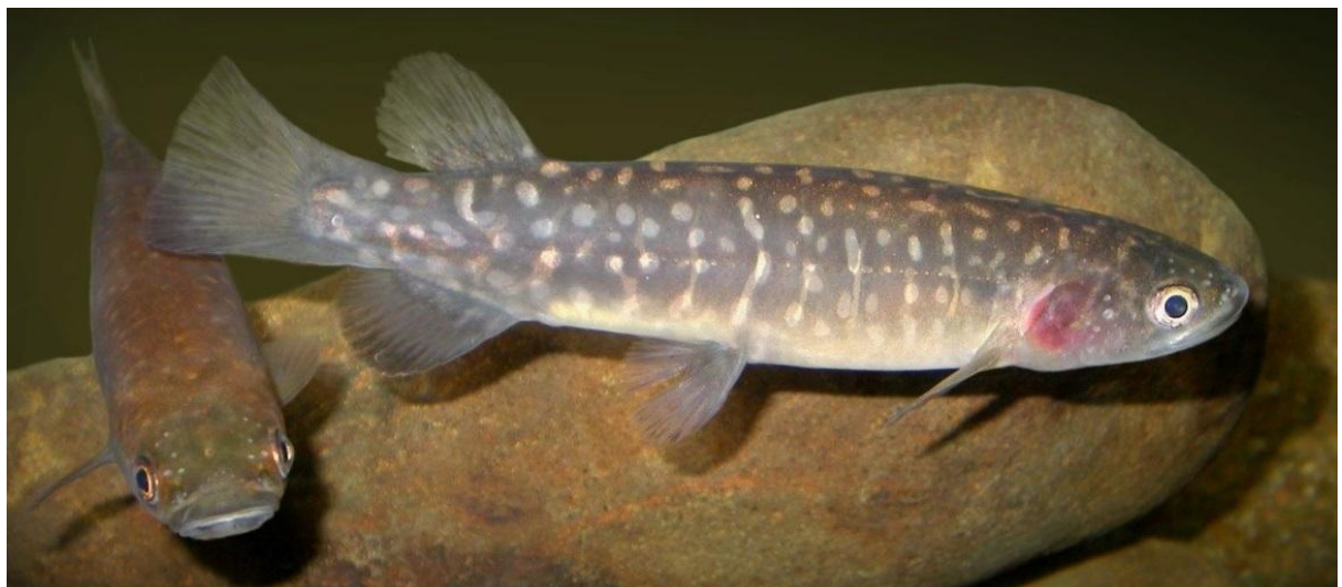
Figure 6: Giant kōkopu

Giant kokopu (Figure 6) are diadromous galaxiid fish that do not have good climbing ability or migratory drive and tend to inhabit lowland, slow-flowing streams, lakes and wetlands. They are the largest galaxiid fish but are seldom seen due to their nocturnal nature.