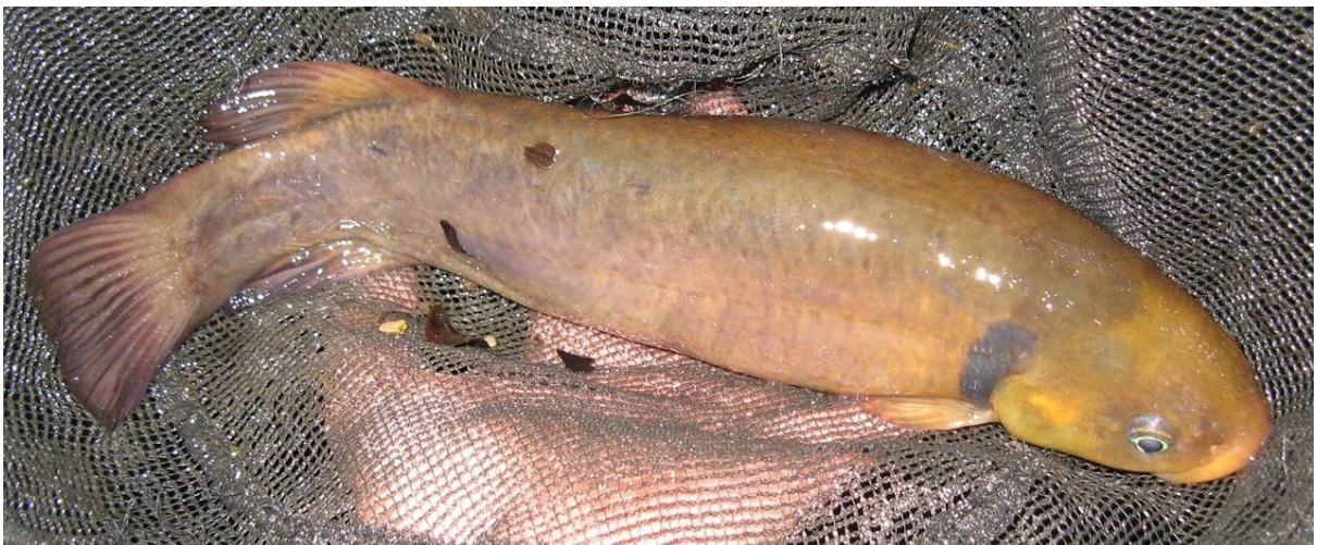
Figure 9: Shortjaw kōkopu ( Stella McQueen )

Shortjaw kokopu (Figure 9) are diadromous galaxiid fish with good climbing capability and an ability to penetrate far inland, occupying habitat at the point where streams transition from lowland to upland gradients.