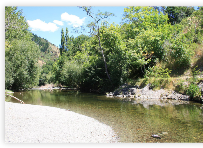
Maitai swimming hole in Branford Park.

The Maitai River bathing holes continue to show improved bacteria counts over the last three summers. The Maitai camp maintained the Good recreation grade. Sunday Hole and Girlies Hole both only had one exceedance but remain with the Fair recreation grade due to the long term trend of elevated bacteria counts over five years. There was no change in the