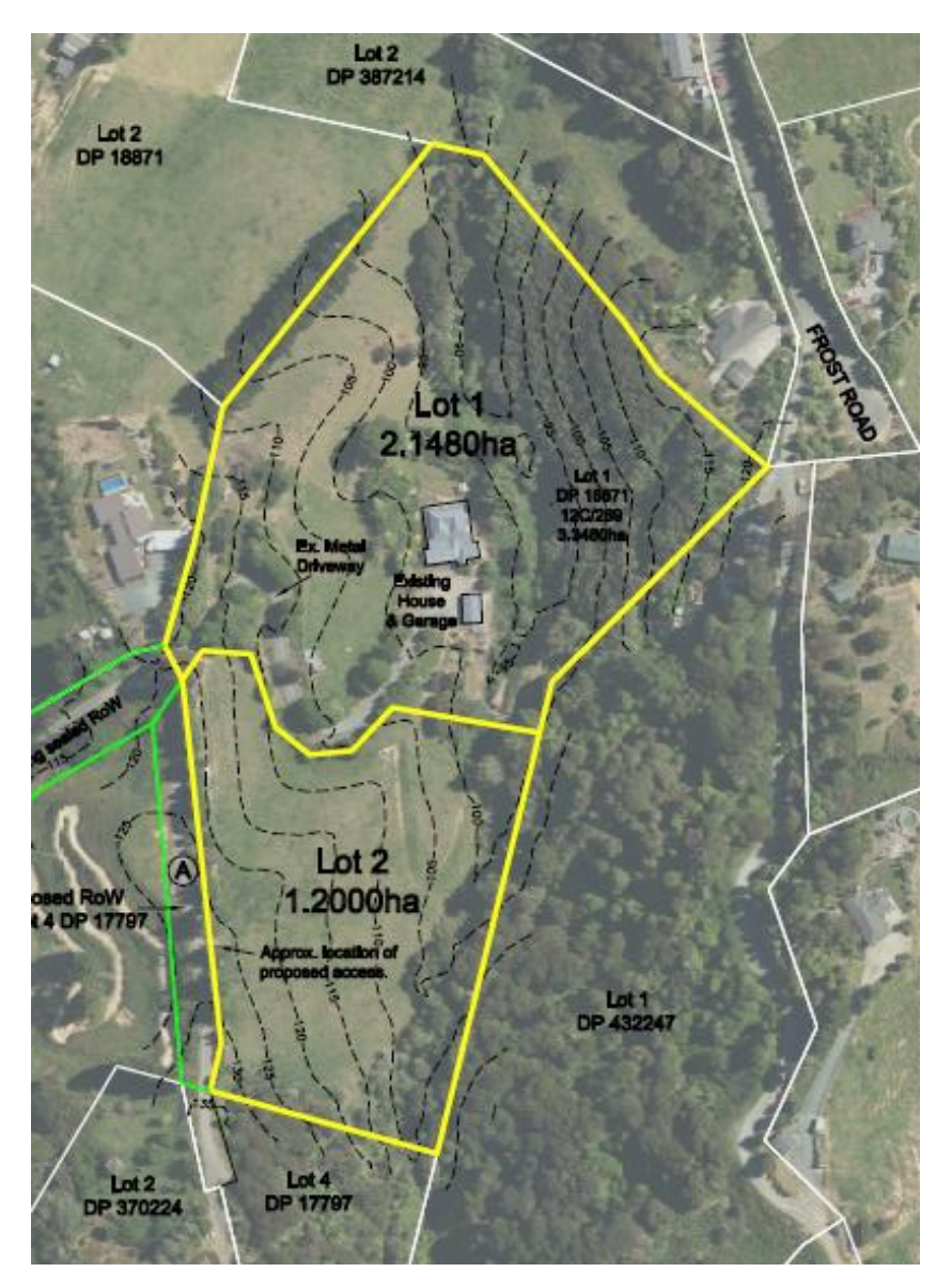
Figure 1: Proposed two lot subdivision (source: scheme plan provided with the application)