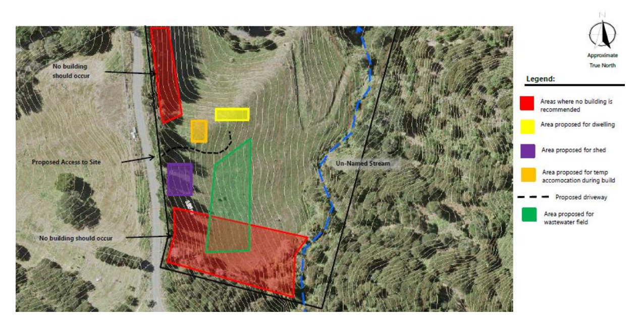
Figure 3: Proposed Conceptual Site Plan; note: the RFI response from FEL proposes a different wastewater field location than shown here

The proposed building site on Lot 2 is located on a north-east facing spur that slopes downhill from Proposed ROW A. No to-scale plan has been provided, but the area proposed for the dwelling (shown in yellow on CGW drawing 18360/03, see Figure 3 below) is set back approx. 27m from the ROW/ western property boundary.